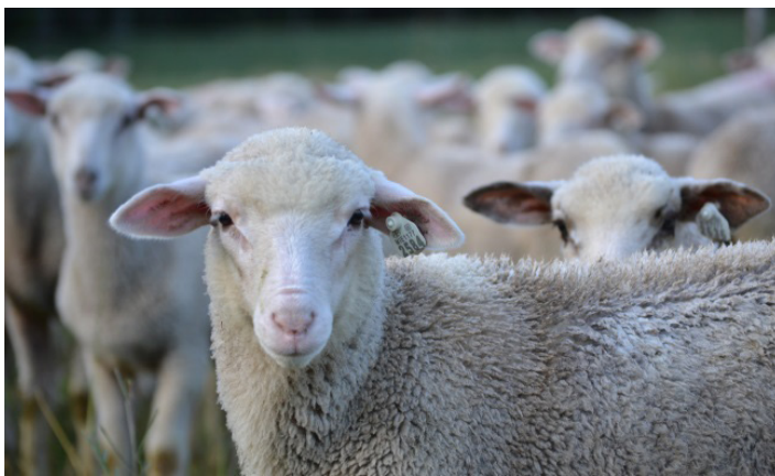
Figure 2. Scrapie tag on a sheep.

All sheep being moved within or outside of Michigan are required to have an official U.S. Department of Agriculture (USDA) scrapie program identifier before being moved off the farm. It is illegal to remove an official USDA individual animal identification method, so don't remove these objects before sale, weigh-in or exhibition.