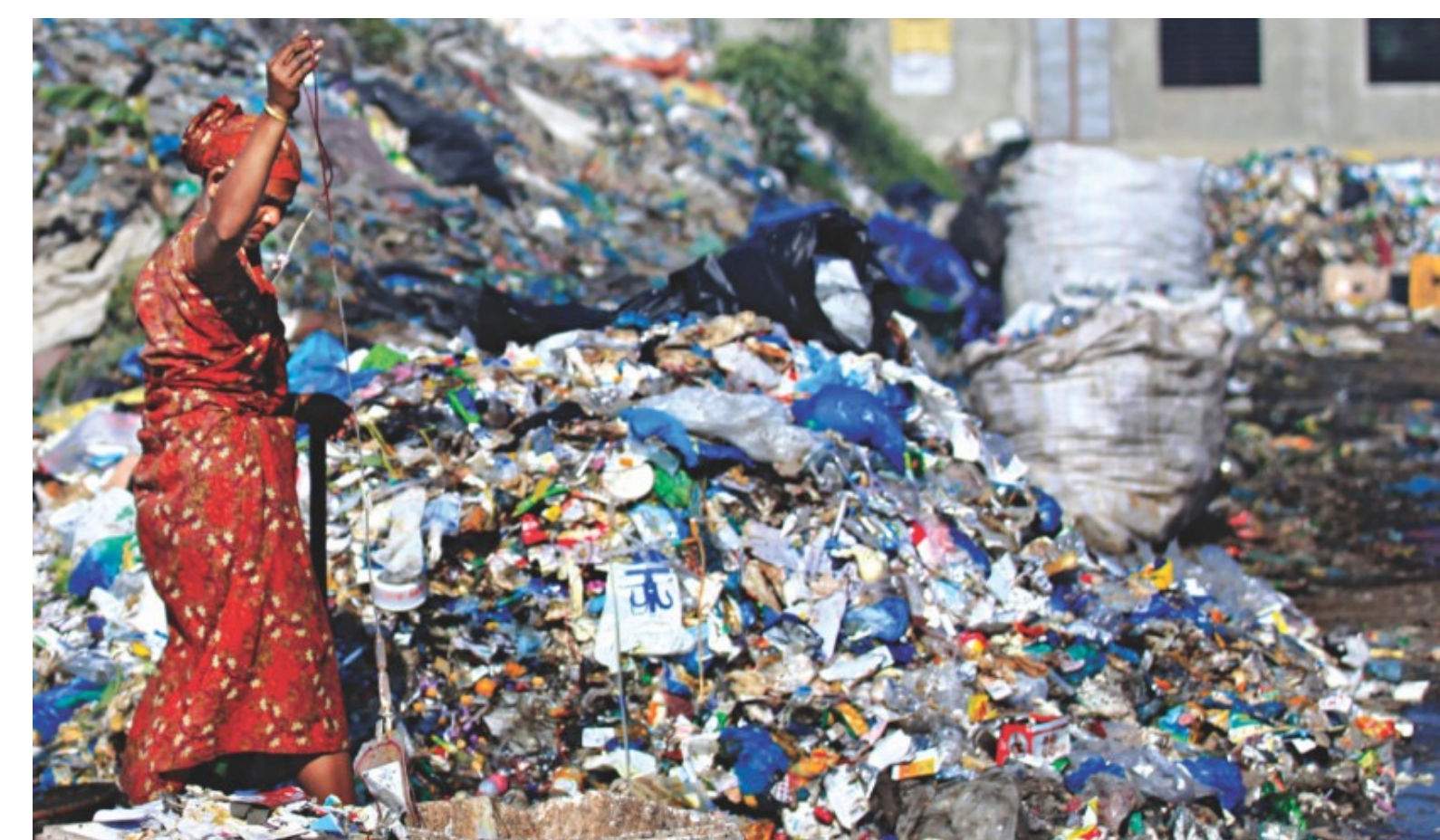
Figure 3: A woman holds onto the pipe of a blood bag, with the blood still visible, at a dumping ground in Parairchawk of Sylhet, Bangladesh, where medical waste is mixed with other wastes. [7].

Landfilling of electronic medical devices or e-waste releases harmful toxins and heavy metals like mercury, arsenic, and lead. These toxins should be filtered out of the landfill's water pools before it is released into the public water system. However, 80% of e-waste is shipped to developing countries in Asia where the infrastructure and regulations for such practices may not exist [9]. This also poses a threat to public health in vulnerable communities.