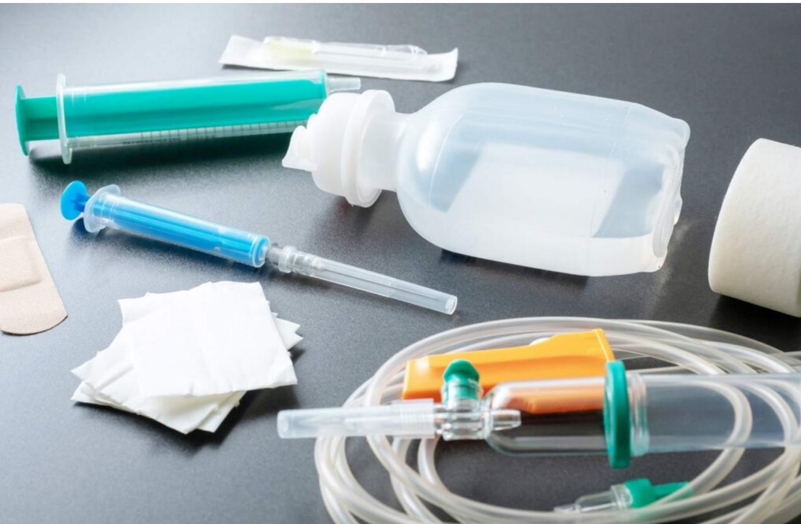
Figure 1: Various mass-produced single-use medical devices. [6]

Current disposal methods include reprocessing of the device, recycling parts of the device, incineration, and landfilling [8]. All methods provide either provide minimal economic and environmental benefits or cause harm to exposed communities through environmental damage and health complications.