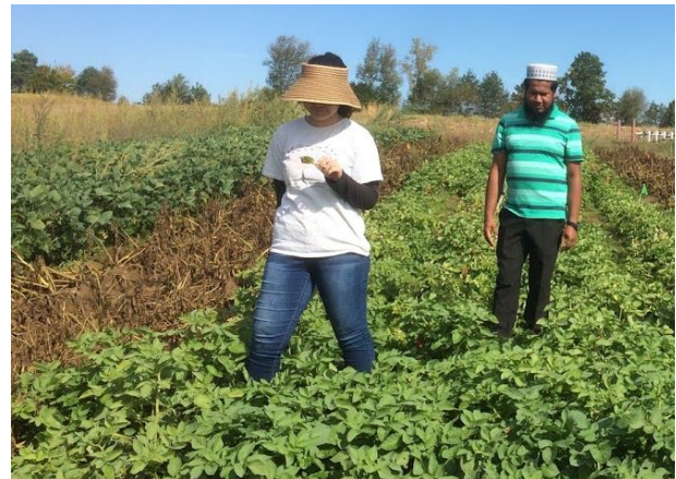
Scientists from Bangladesh and Indonesia visit the MSU trial fields to learn new techniques and methods.