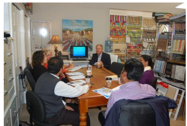
CEC sessions are held inside local downtown businesses!

MSU is an affirmative-action, equal-opportunity employer, committed to achieving excellence through a diverse workforce and inclusive culture that encourages all people to reach their full potential. Michigan State University Extension programs and materials are open to all without regard to race, color, national origin, gender, gender identity, religion, age, height, weight, disability, political beliefs, sexual orientation, marital status, family status or veteran status. Issued in furtherance of MSU Extension work, acts of May 8 and June 30, 1914, in cooperation with the U.S. Department of Agriculture. Quentin Tyler, Director, MSU Extension, East Lansing, MI 48824. This information is for educational purposes only. Reference to commercial products or trade names does not imply endorsement by MSU Extension or bias against those not mentioned.