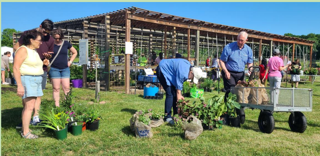
Top left photo by Renee Cottrell