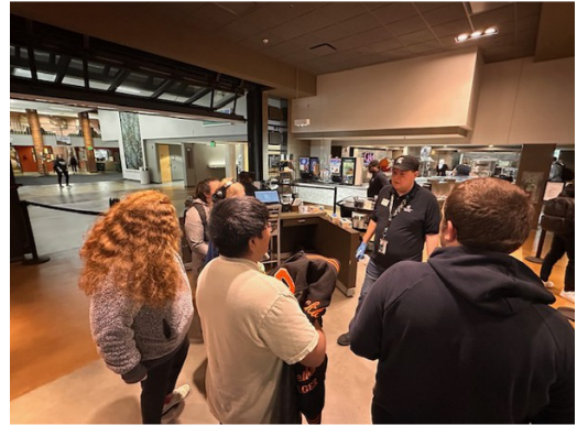
Graduate Work Interview