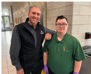
AJ @ Biomedical Facilities