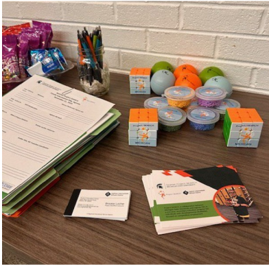
Project SEARCH Parent Information Night