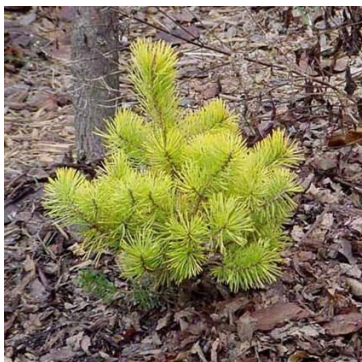
Summer Foliage (American Confer Society)

Pinus sylvestris 'Gold Coin' is a popular evergreen conifer prized for its dramatic, intense gold-yellow needles during winter, which fade to a light, pale green in summer. This upright, pyramidal tree grows 8–12 inches annually, reaching 10–20 feet tall and 8–15 feet wide, making it a vibrant, deer-resistant specimen (Conifer Trees Database, American Conifer Society).