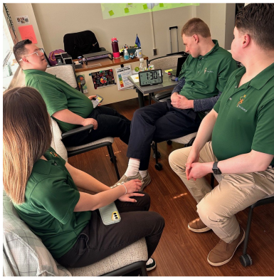
Class Jeopardy Challenge