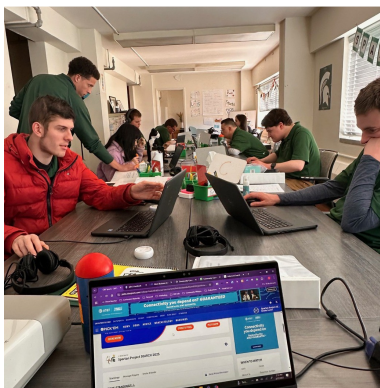
Class March Madness Brackets