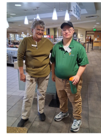
AJ @ The Gallery