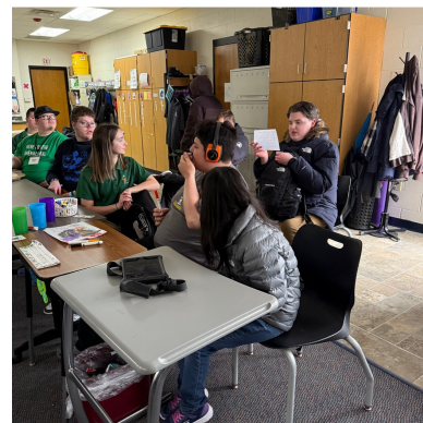
Visiting the SAIL Mason Classroom