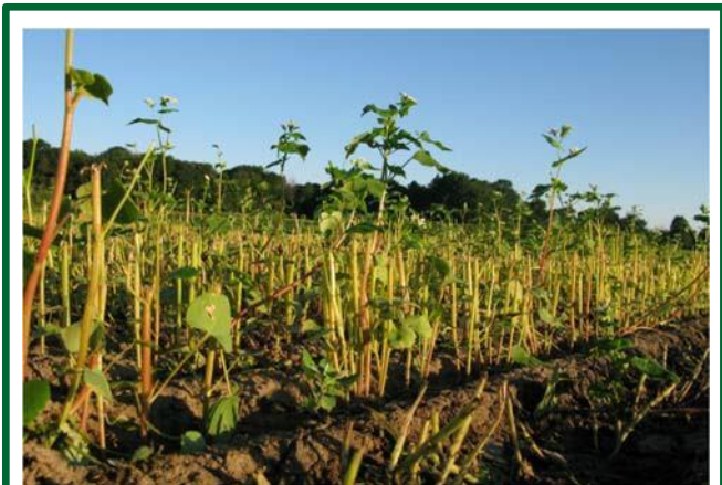
Figure 2. Flowering regrowth in buckwheat shortly after failed termination by mowing.

In systems that include tillage, or are managed organically, mechanical soil disturbance can be a reliable method of cover crop termination. A moldboard plow is the most effective tool to manage dense stands of overwintering cover crops. Chisel plowing is also an effective method for termination of most cover crops. However, multiple passes may be required if large amounts of cover crop biomass are present. Rototillers can also terminate cover crops when biomass levels are low enough to avoid clogging. Vertical tillage tools are not reliable for cover crop termination. Mowing is also not a reliable method of terminating most cover crops (Figure 2).