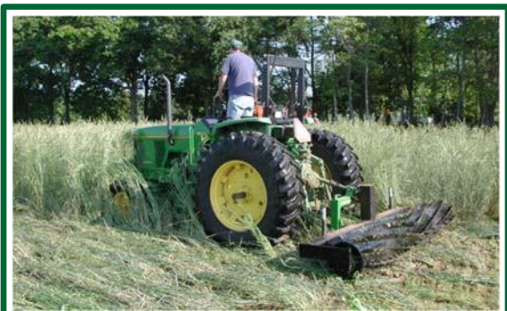
Figure 3. Roller crimping cereal rye.

dates. Examples of cover crops that have been successfully terminated using the roller crimper include cereal rye (Figure 3) and hairy vetch. Success is dependent on the stage of the cover crop, with these two species required to reach the point of flowering (Feeke's 10.5/Zadoks 60, for cereal rye). Crimping prior to flowering may result in continued growth. However, waiting until the time of flowering adds the risk that viable seed could be produced, resulting in volunteer plants emerging in the future. Utilizing the roller crimper in combination with herbicides increases the likelihood of successful termination.