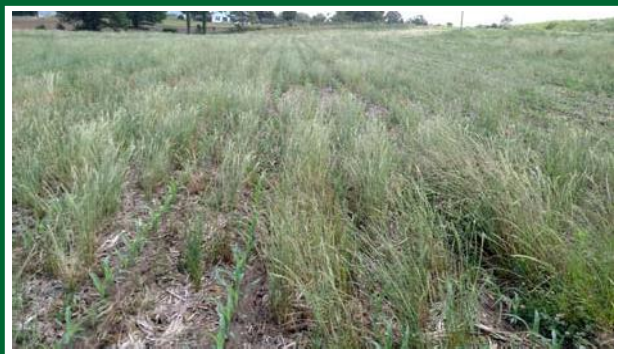
Figure 5. Failed control of annual ryegrass prior to corn planting resulting in crop competition and seed production.

Termination timing in the event another application or different method is required. Occasionally multiple herbicide applications will be required to successfully terminate a cover crop (Figure 5). Early termination allows for flexibility should a second application be needed.