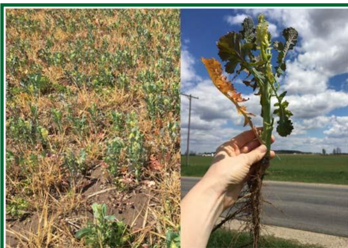
Figure 4 Glyphosate terminated the cereal rye (left), but failed to control bolting rapeseed (right) in this two-species mixture.

Termination prior to flowering. Plants that have started to flower (reached the reproductive stage) may be difficult to control as the movement of photosynthates change in the plant, thereby altering the movement of herbicides that are translocated (Figure 4).