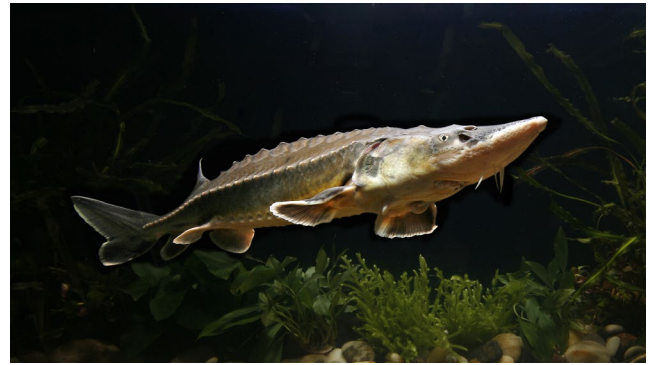
FIGURE 2 The Chinese sturgeon.

Non-native escapees can also destroy the genetic integrity of native species through genetic pollution, which can reduce genetic diversity, alter population structure and cause species extinctions in native ecosystems. In China, about 10 NAS have the potential