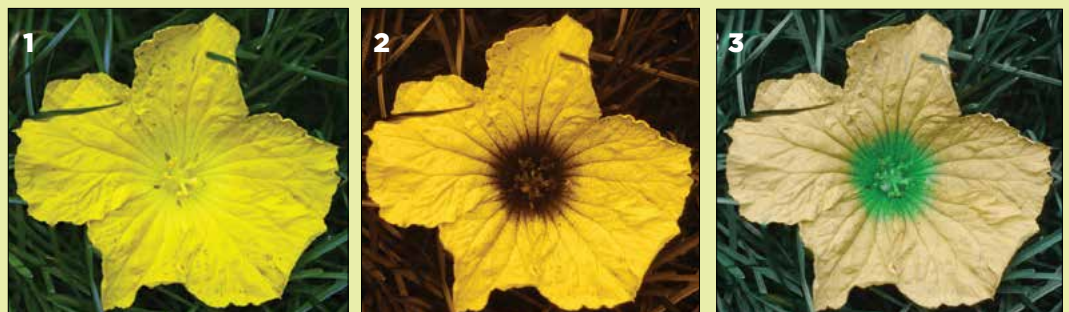
1) Human view. 2) Ultraviolet. 3) Emulates insect vision: visible light with reduced red light, combined with ultraviolet.

Bee expert Zachary Huang applies his skill as a photographer to his science. Here he's shared with us a comparison of one flower filtered to show human vision, ultra-violet and insect vision. Zach says, "Bugs always see a better picture than us!"