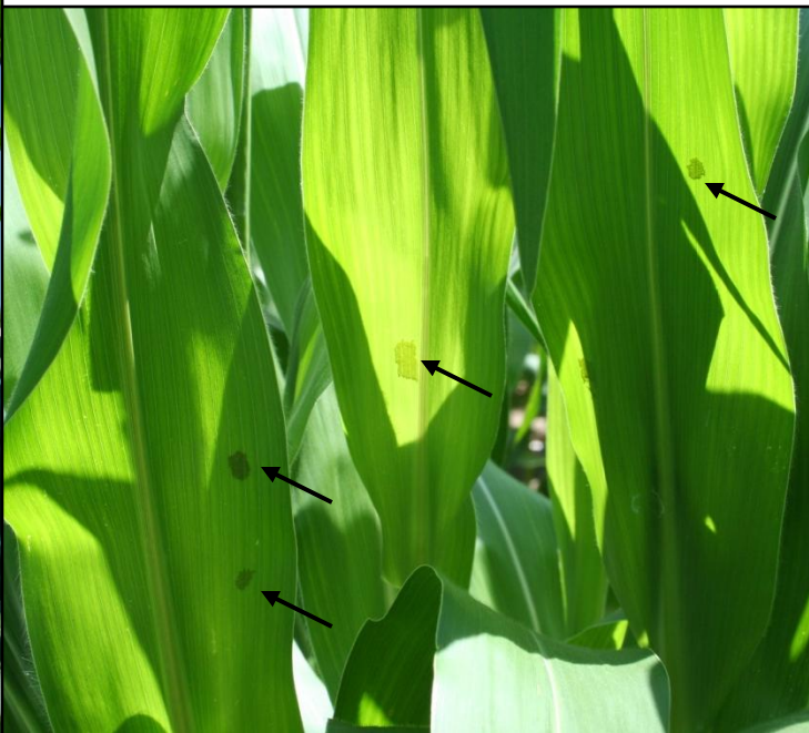
Tip – if the sun is shining through leaves, look for the outline of eggs on the leaf underside.