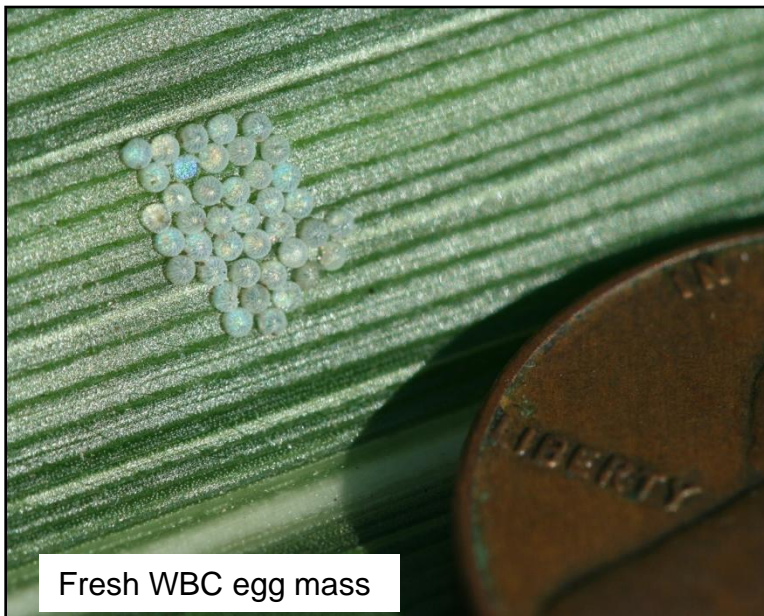
Fresh WBC egg mass

These pictures can assist you in recognizing and scouting for WBC. Scouting for WBC is cost effective because infestations vary greatly from field to field.