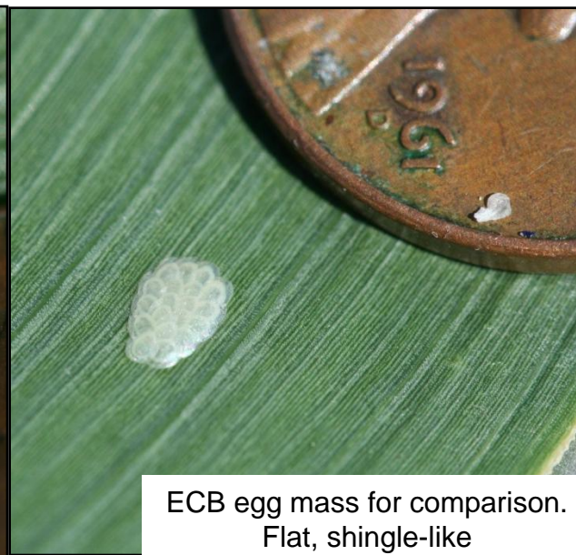
ECB egg mass for comparison. Flat, shingle-like