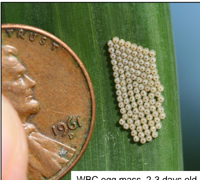
WBC egg mass, 2-3 days old