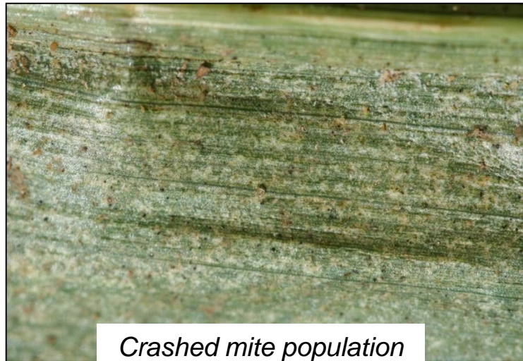
Crashed mite population

Note that spider mite populations can resurge quickly after treatment due to: