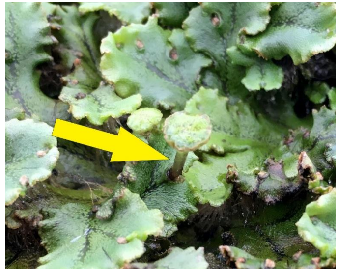
Figure 4. The arrow shows the male reproductive structure called antheridia, which produces the sperm for sexual reproduction in liverwort. The antheridia are located on the upper surface of a flattened disc atop a narrow stalk called antheridiophore.

When possible, avoid introducing infested stock to the crop area. Sanitation is very important in controlling liverwort in production nurseries and greenhouses. Sanitize greenhouse surfaces, pots and tools with labeled disinfectants, such as