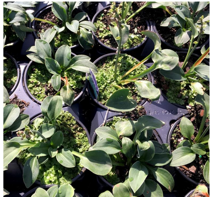
Figure 1. Liverwort growing profusely in the container along with ornamental plants inside a greenhouse.

Liverworts including Marchantia polymorpha prefer