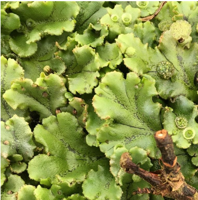
Figure 2. Dichotomously branched vegetative thallus structure of liverwort ( Marchantia polymorpha ).

For additional information, visit www.canr.msu.edu/outreach