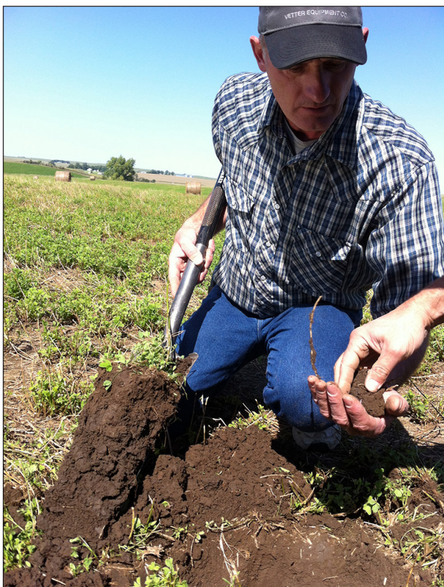
Figure 1 Examining organically managed soil under alfalfa

When crops need additional nutrients, organic producers choose plant, animal, and natural mineral-based fertilizers, most of which release nutrients gradually through the action of soil organisms. Synthetic fertilizers are prohibited in organic production systems.