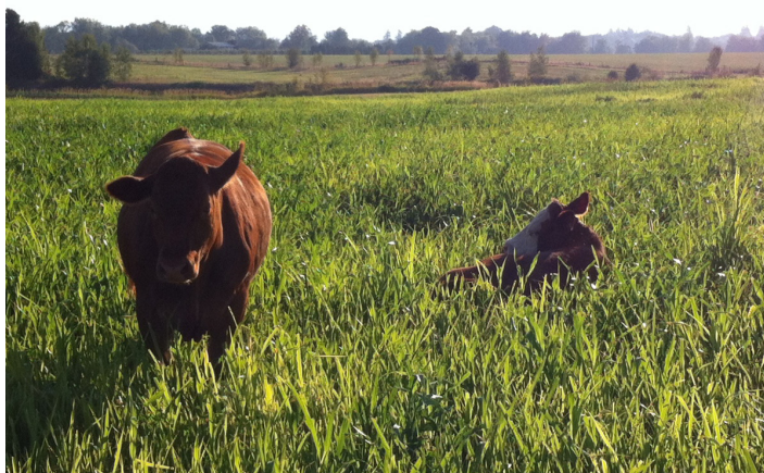
Figure 9 Cows in sudan grass on an organic farm

Treated Wood on Organic Farms (University of Tennessee):