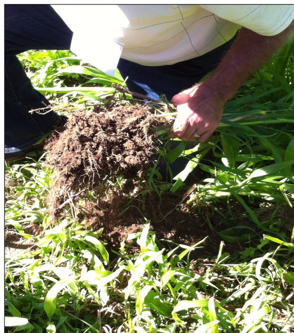
Figure 3 Roots and soil under organically managed sudan grass cover crop

State-specific versions of this guide are being developed for certain States; final versions will be available here: http://www.nrcs.usda.gov/wps/portal/nrcs/main/national/landuse/crops/organic/ . This publication discusses CPS 590 as a tool for meeting the USDA organic regulations' nutrient management requirements and minimizing environmental risks from applied N and P. It covers major and minor nutrients, and how to estimate N release from cover crops, past organic inputs, and soil organic matter.