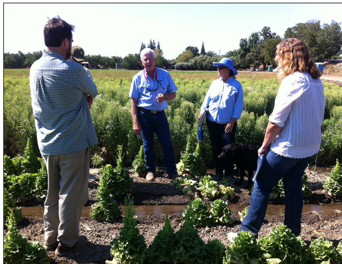
Figure 2 NRCS staff and producers discuss organically managed lettuce seed production

A producer sends their completed OSP along with a base payment to the certification agency. If all farm management information, field maps, and input ingredient information is complete, the certification agency reviews the OSP and then assigns the file to an inspector. If it appears the operation does not meet organic regulations, the certification agency will typically discuss areas of noncompliance with the operator and outline steps that need to be taken before the organic certification process can move forward. Once certified, organic producers must update their OSP throughout the year.