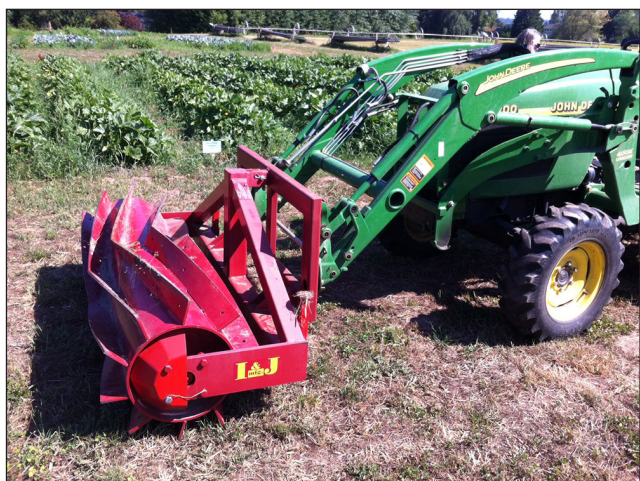
Figure 6 Roller crimper

Biorationals: Ecological Pest Management Database (ATTRA) https://attra.ncat.org/attra-pub/biorationals/ . This tool provides information on organic and other pesticides as well as preventive measures for common pests; allows searches by pest, trade name, or active ingredient; has links to labels and manufacturer information; and notes which materials are listed by OMRI (Organic Materials Review Institute). Because OMRI listings are frequently updated, organic producers should check with their certifiers prior to applying any materials to their crops or livestock.