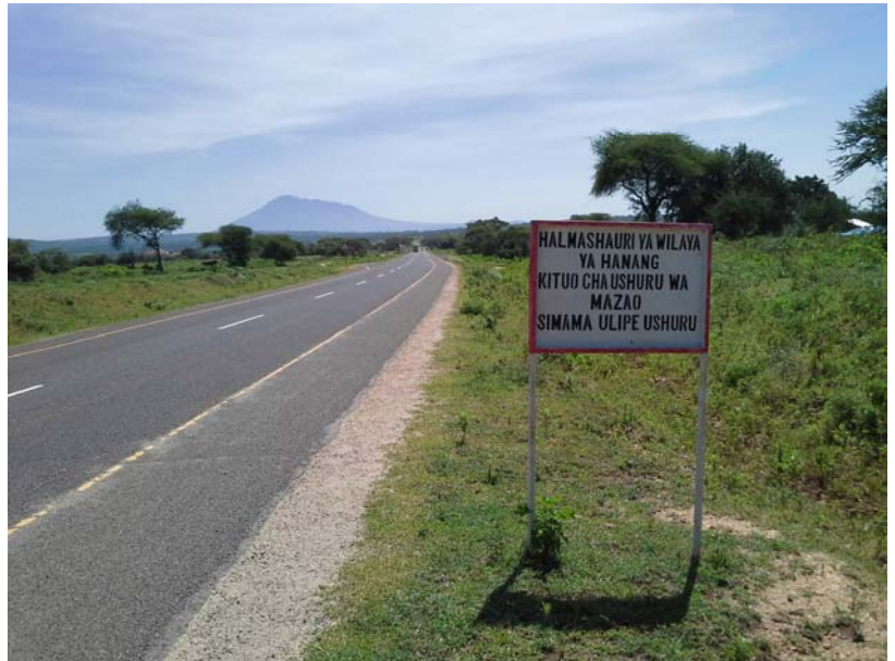
Pay district (LGA) crop tax at toll station ahead

The FSP-led study of LGA crop cess (tax) levels and their collection highlighted three key problems with the current cash-based collection system, and a potential solution. First, tax rates in some districts are quite high and are likely reducing value chain participants' investments in crop production and marketing. Second, the study estimates that only about 25% of taxes owed are actually paid, on average. Third, this low compliance may in part be due to trader and agribusiness groups' claims that low transparency of the current system enables LGA officials to embezzle some tax revenue. The study suggested that movement to an e-payment tax system should allow tax levels to be reduced (thus improving the enabling environment for private-sector led growth in agriculture) maintaining or even increasing tax revenues as taxpayer compliance improves.