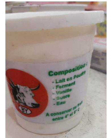
List of ingredients