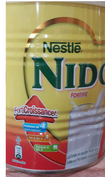
Nestle Nido milk powder