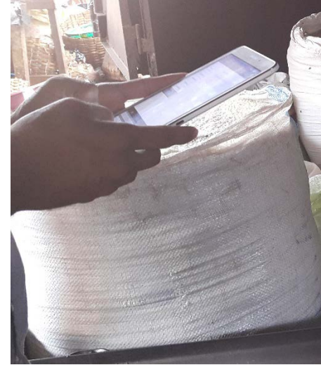
Using tablets for data collection