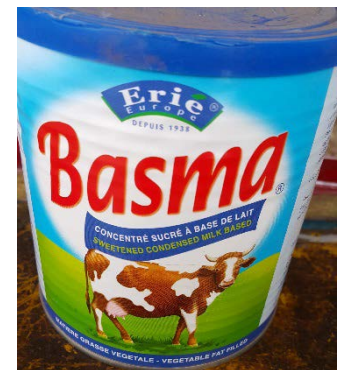
Sweetened condensed milk