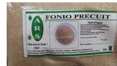
Locally processed fonio