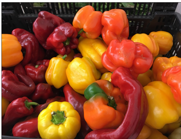
These hybrid pepper seeds yield many shapes and colors.

little to no seed sprouting. See a condensed table of soil temperatures required for seed germination at https://sacmg.ucanr.edu/files/164220.pdf .