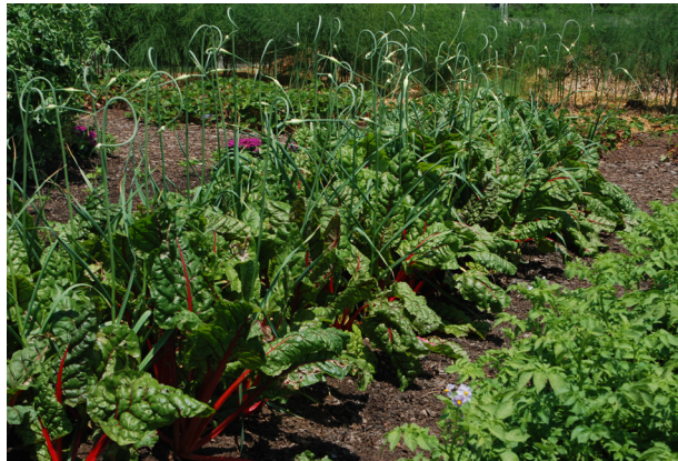
Swiss chard inter-planted with garlic that will be harvested much later, makes smart use of space.

cultivars for various vegetables such as late blight-resistant tomatoes. Thoroughly inspect plants for signs of insects by checking under leaves and around stem tips. Avoid plants with leaves that are browning, spotted or wilting. A taller plant doesn't mean a healthier or sturdier plant. If plants do not receive adequate light while developing, they often stretch toward the light and are weakened.