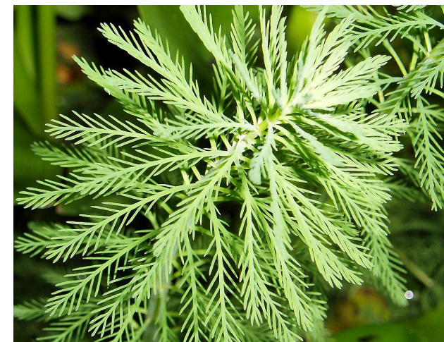
Parrot feather | Myriophyllum aquaticum

Other names: Myriophyllum brasiliensis, Myriophyllum brasiliense, Myriophyllum proserpinacoides and Enydria aquatica