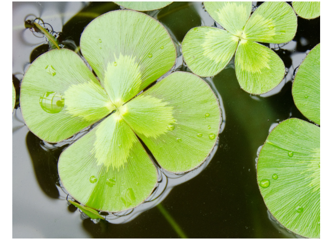
European water clover | Marsilea quadrifolia

These plants are not prohibited from sale but have invasive tendencies. If purchasing these plants, keep them contained to protect our waterways.