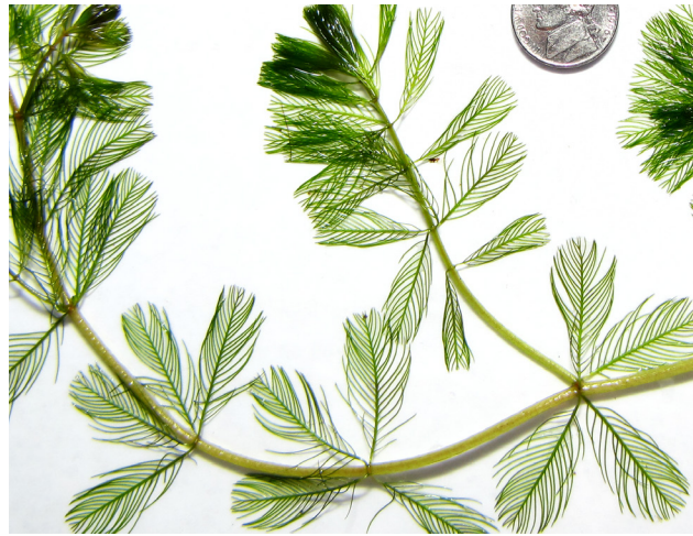
Eurasian water-milfoil | Myriophyllum spicatum