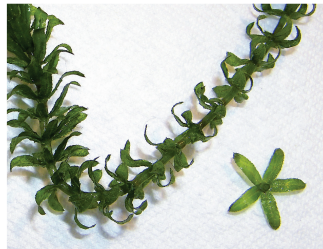
Hydrilla | Hydrilla verticillata