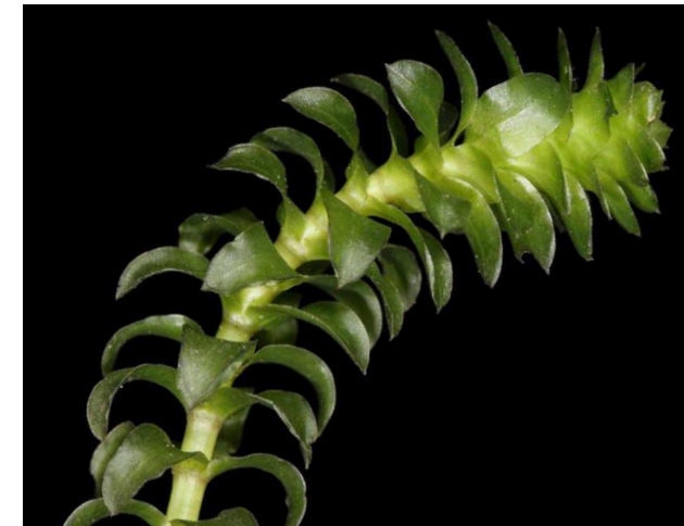
Brazilian elodea | Egeria densa

Other names: Elodea densa, Anacharis densa and Philotria densa