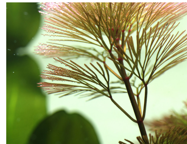
Carolina fanwort | Cabomba caroliniana