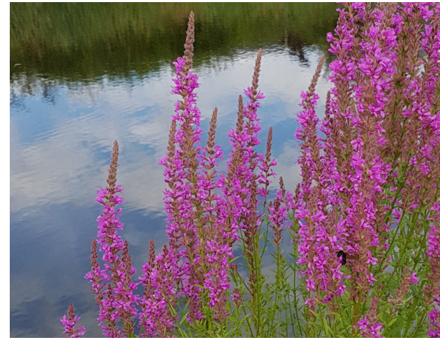
Purple loosestrife | Lythrum salicaria