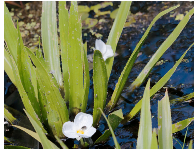
Water soldier | Stratiotes aloides