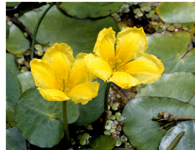
Yellow floating heart | Nymphoides Peltata