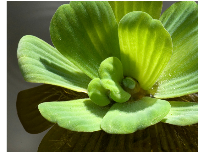
Water lettuce | Pistia stratiotes