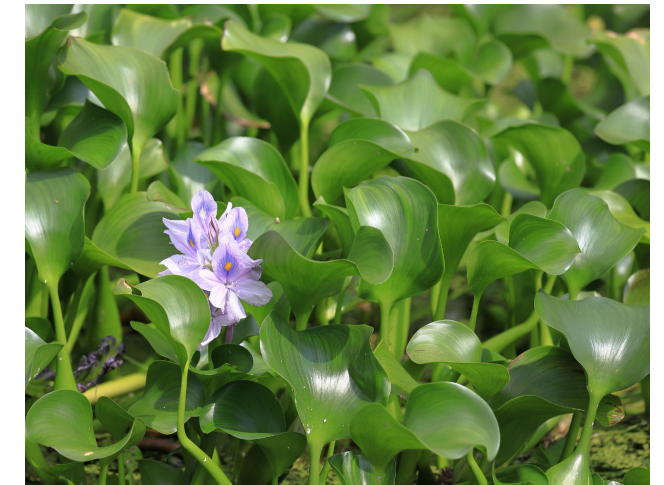
Water hyacinth | Eichhornia crassipes