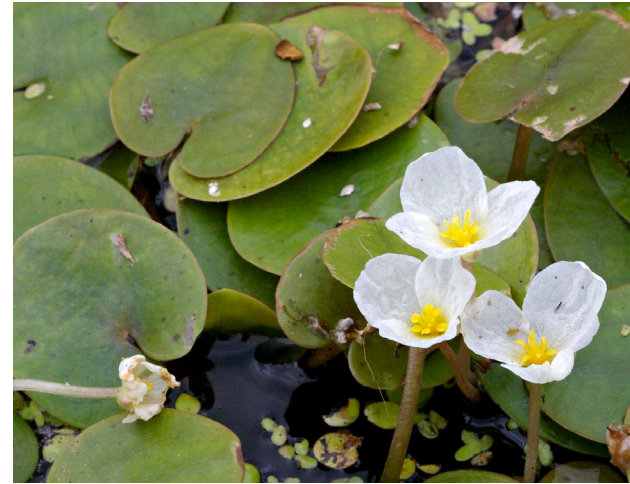
European frog-bit | Hydrocharis morsus-ranae

The following plants, fragments, seeds or a hybrid or genetically engineered variant thereof are specifically prohibited or restricted and cannot be sold or imported.