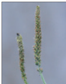
Broadleaf plantain flowering spikes.

All leaves originate from a basal rosette. Cotyledons are long and spatula-shaped. Leaves are generally smooth and broadly to narrowly oval, with parallel veins and smooth to slightly wavy leaf margins. Leaf base tapers to a distinct petiole. Petioles are usually green but occasionally pale pink.