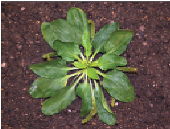
Broadleaf plantain rosette.