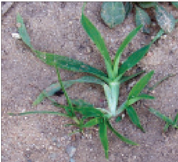
Large crabgrass seedling.