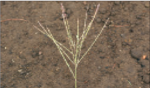
Large crabgrass seedhead.