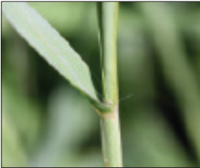
Smooth crabgrass collar region.

Differs by having a smaller stature, hairless to sparsely hairy leaves and sheath, a tuft of long hairs at the collar region and stems that do not root at the nodes.