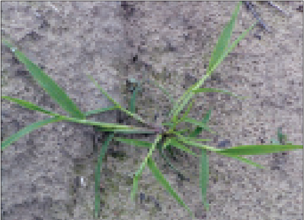
Smooth crabgrass plant.