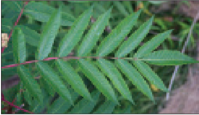
Staghorn sumac leaf.