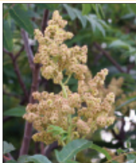
Staghorn sumac flower cluster.