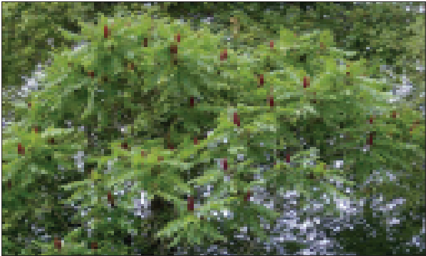
Staghorn sumac foliage and fruit.