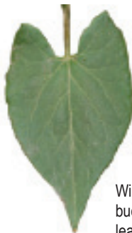
Wild buckwheat leaf.