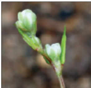
Wild buckwheat flowers.