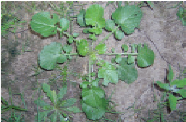
Yellow rocket rosette.