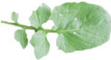
Yellow rocket lower leaf.