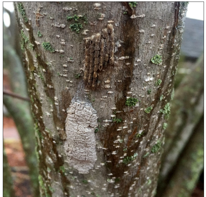
Photo 7. A current-year egg mass beneath an old egg mass on tree of heaven.

Once SLF adult females have matured and mated, each female will lay one or sometimes two egg masses (Photo 7). Egg masses are usually laid on tree trunks or branches but