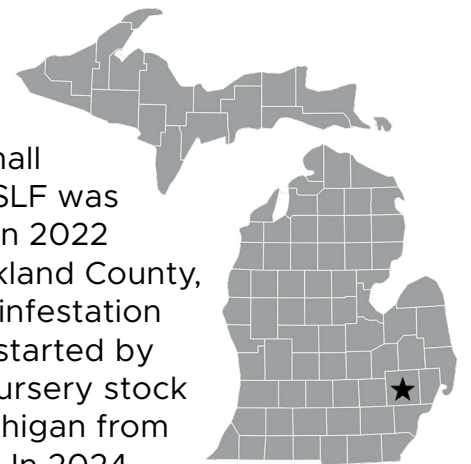
Photo 4. The first detection of SLF in Michigan was located in Oakland County (starred on map).

Unfortunately, SLF is now established in Michigan. A small population of SLF was first detected in 2022 in Pontiac (Oakland County, Photo 4). This infestation was probably started by SLF eggs on nursery stock shipped to Michigan from the east coast. In 2024, SLF was detected in areas of Monroe and Wayne counties, at least partly reflecting the high-density infestations in Toledo, Ohio, just south of the state border. Although adult SLF have wings and can fly, they are also good hitchhikers