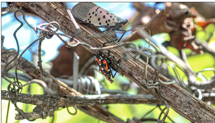
Photo 8. Adult and fourth instar nymph on a grapevine.

SLF can feed on a variety of trees and woody vines, including maples, willows, black walnut, fruit trees, grapevines and hops vines. However, tree of heaven ( Ailanthus altissima ) is their most preferred host. Tree of heaven, native to China, is an invasive species commonly found in urban settings thanks to its ability to grow in disturbed, nutrient poor sites. High densities of SLF are frequently associated with individual large trees of heaven or with large stands of younger trees. Information on tree of heaven identification, biology, its history in the U.S. and management options is available in the Michigan State University Extension bulletin E3476, “A Tale of Two Invaders: Tree of Heaven and Spotted Lanternfly” at https://www.canr.msu.edu/resources/a-tale-of-two-invaders-tree-of-heaven-and-spotted-lanternfly .