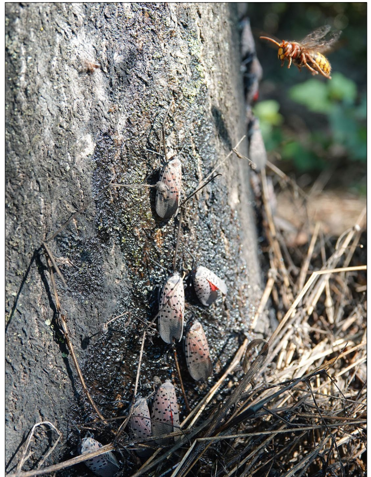
Photo 9. A wasp hovers over several spotted lanternfly feeding on a honeydew-covered tree of heaven.