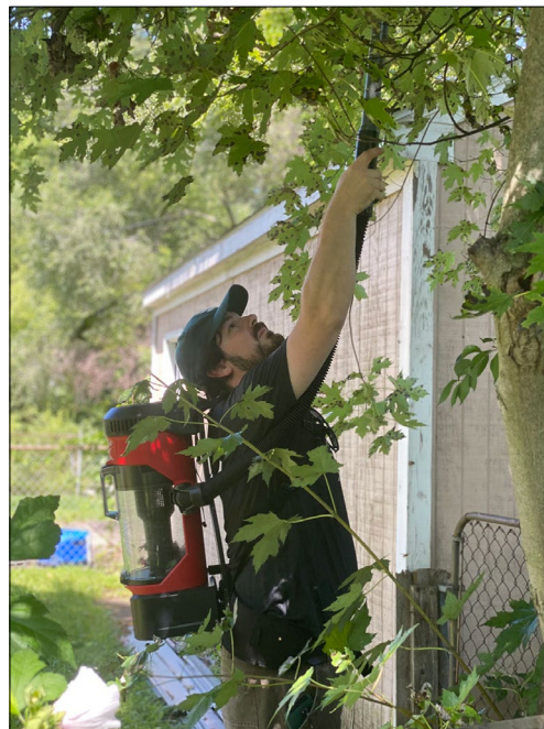
Photo 14. Using a backpack vacuum to remove spotted lanternfly on a maple tree.

Systemic insecticides, such as dinotefuran, can be applied to tree of heaven or other