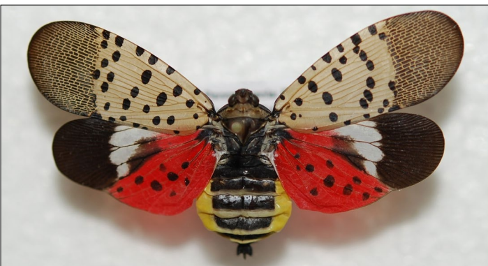
Photo 1. Adult spotted lanternfly with extended wings.

and the planthopper family (Fulgoridae). Immature and adult SLFs pierce the bark of tree branches, trunks and woody vines and feed on sap (Photo 2). When disturbed, these insects will jump, often a considerable distance, to startle would-be predators.