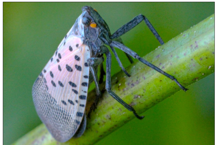
Photo 2. Spotted lanternfly, such as this adult, use their long mouthparts to feed on plant sap.