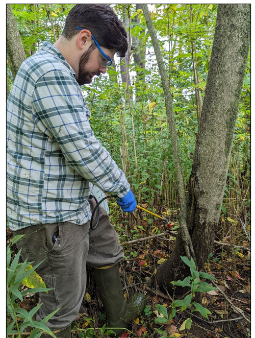
Photo 15. A researcher applies a basal trunk spray of dinotefuran to a tree of heaven.