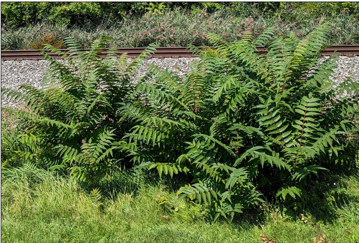
Photo 13. Vigorous young tree of heaven that sprouted from stumps.