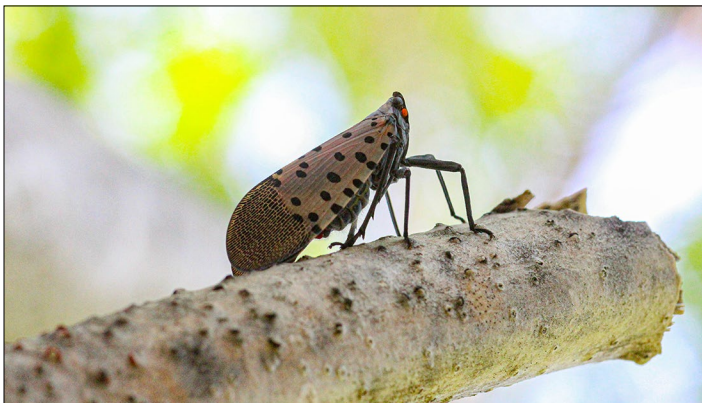
Photo 5. Adult spotted lanternfly perched on a branch of a tree of heaven.

As SLF grow and develop, their appearance changes. Adults (Photo 5), which can be present from August to early November, are approximately 1 inch long and 0.5 inches