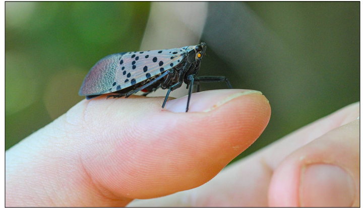
Photo 11. Adult spotted lanternfly poses on a thumb.