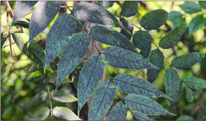
Photo 10. Black sooty mold growing on honeydew-covered leaves of a tree of heaven.