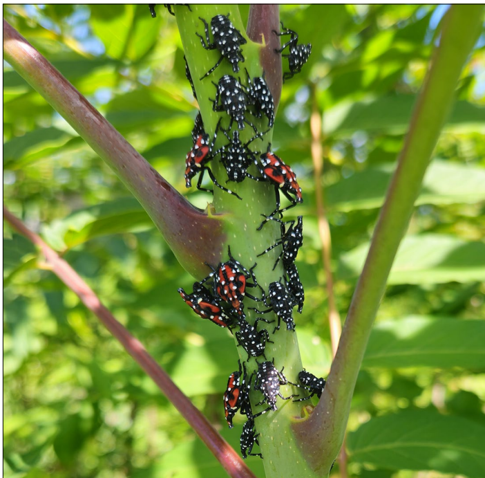
Photo 6. Third and fourth instar spotted lanternfly nymphs feeding on a tree of heaven stem.

wide. Their forewings are translucent with a pinkish or gray-brown tint, black spots and thin black stripes on the tips. Their hindwings are bright red with black spots, black tips and a white stripe. At rest, adult SLF hold their wings tented over their bodies. When the adults extend their wings, their black and yellow abdomen is revealed.