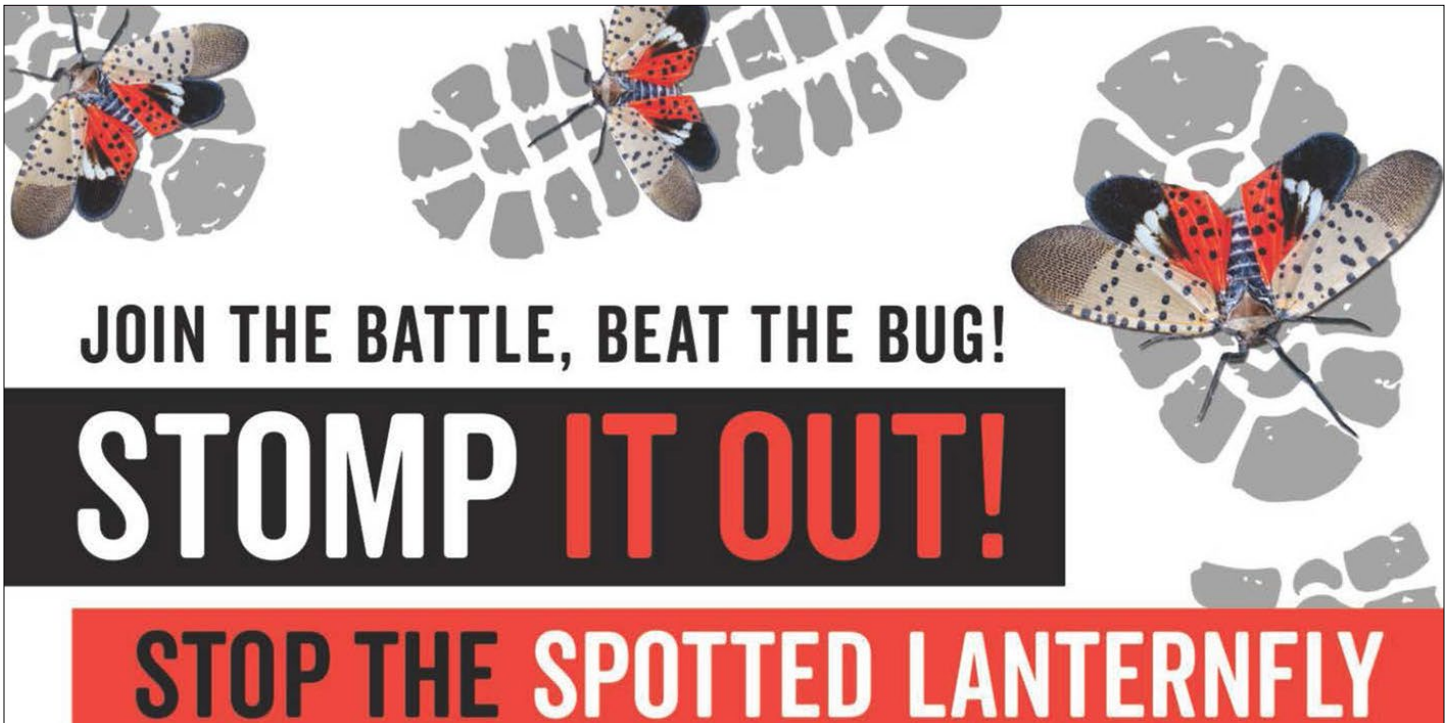
Photo 3. Example of the SLF “Stomp it out!” campaign in New Jersey.