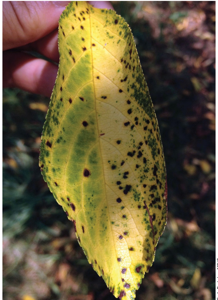
Emily Pochubay, MSUE

A cherry leaf spot disease model on Enviro-weather incorporates data on the disease's development in relation to past and current weather conditions to determine whether a particular location has experienced a possible infection period. Using real time data, the model assesses the severity of infection periods. This model helps growers assess the effectiveness of their management programs and decide when to apply or reapply a fungicide.