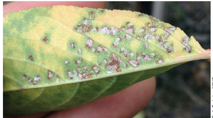
Emily Pochubay, MSUE

Purple lesions and chlorosis caused by infection of the cherry leaf fungus on the top of a tart cherry leaf (above) and bottom (below).