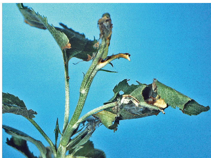
Fig. 8. Terminal damage to apple foliage caused by obliquebanded leafroller feeding.