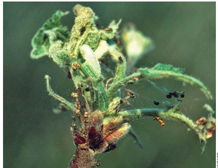
Fig. 3. Young green fruitworm larva feeding on an apple bud cluster.

Green fruitworm have only one generation annually. Female green fruitworm moths begin egg laying on twigs and developing leaves when apples and peaches are in the half-inch green stage; green fruitworm larvae pass through six instars. Young larvae feed on new leaves and flower buds and can often be found inside a rolled leaf or bud cluster (Fig. 3).