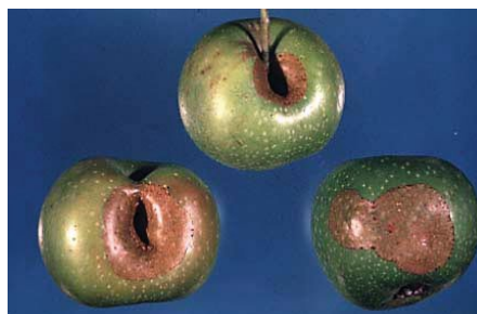
Fig. 7. Fruit damage to apples caused by obliquebanded leafroller larval feeding in the spring.

The second brood larvae, which develop in late summer and fall, feed primarily on leaves until they enter diapause, although they may occasionally damage fruit. The most serious injury from overwintering obliquebanded leafroller larvae occurs just prior to and shortly after petal fall when the developing fruit is damaged. Many of these damaged fruits drop prematurely, but a small percentage remain on the tree, exhibiting deep corky scars and indentations at harvest (Fig. 7).