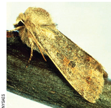
Fig. 1. Green fruitworm adult.

Older larvae damage flower clusters during bloom and continue to feed on developing fruit and leaves for one to two weeks after petal fall (Fig. 4). They then drop to the ground, burrow 2 to 4 inches beneath the soil surface and pupate.