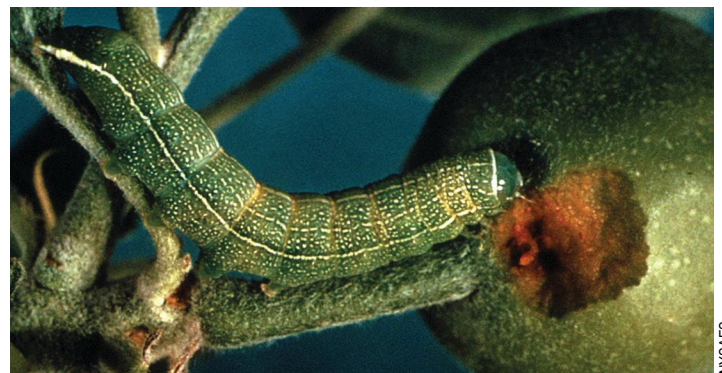
Fig. 4. Older green fruitworm larva feeding on developing apple.

Older larvae damage flower clusters during bloom and continue to feed on developing fruit and leaves for one to two weeks after petal fall (Fig. 4). They then drop to the ground, burrow 2 to 4 inches beneath the soil surface and pupate.