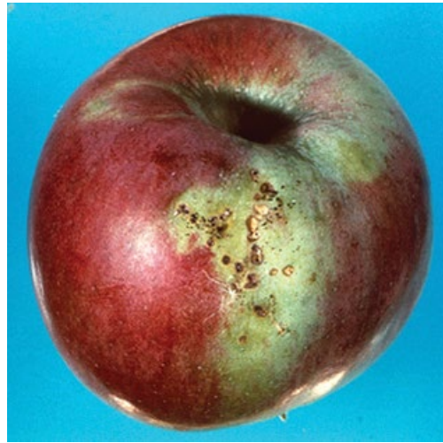
Fig. 9. Fruit damage to apple caused by late season obliquebanded leafroller feeding.

Apply protective sprays in orchards that have had a past history of severe obliquebanded leafroller fruit damage or if populations of overwintering larvae were high; the first spray should be timed to coincide with the first hatch of larvae at approximately 350 degree-day base 43 degrees Fahrenheit after biofix, followed by a second spray 10 to 14 days later. Refer to the NEWA Apple Insect Models website ( newa.cornell.edu/index.php?page=apple-insects ) for current information on the occurrence, development and management of this pest in your specific location.