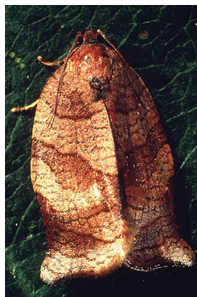
Fig. 2. Obliquebanded leafroller adult.