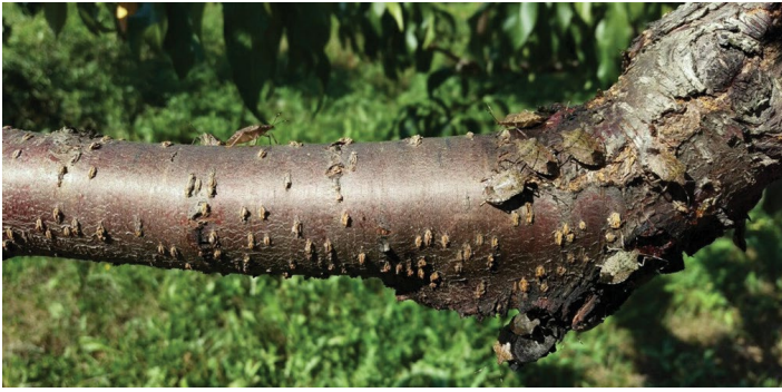
Adults blend in with this peach branch.