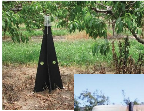
Above and to the right are photos of a free-standing pyramid style trap. Traps are baited with an aggregation pheromone that attracts BMSB and then captures them in the clear top.

For more information on how to monitor and manage brown marmorated stink bugs, see Michigan State University Extension bulletin E0154 "Michigan Fruit Management Guide," or stopBMSB.org .