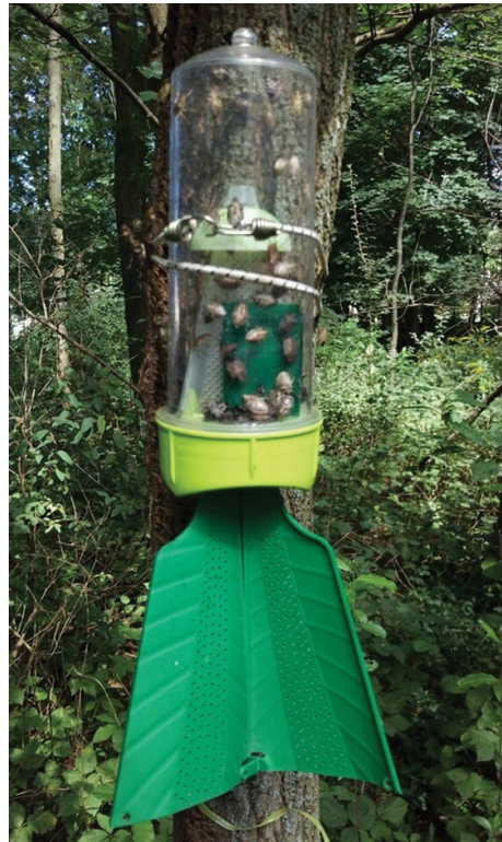
The Rescue brand trap is a pyramid style trap that must be attached to a tree trunk or post.