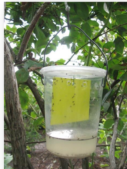
Trap for capturing adult SWD flies.

These flies can be trapped using a simple monitoring trap consisting of a plastic 32oz cup with ten 3/16"-3/8" holes around the upper side of the cup, leaving a 3-4 inch section without holes to facilitate pouring out of the liquid attractant, or bait (photo). The holes can be drilled in sturdy containers or burned with a hot wire or soldering iron. The small holes allow access to vinegar flies, but keep out larger flies, moths, etc.