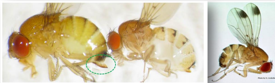
L-R: a female SWD with the ovipositor highlighted; a 'look-alike' Drosophila fly; and a male SWD.

Male SWD have a distinctive spot on each wing (right panel photo). In contrast, female SWD (left panel) do not have dots on the wing, so their ovipositor needs to be examined closely in search of its serrated characteristics. Use a 30X magnification hand lens or microscope to detect the distinctive saw-toothed ovipositor on female SWD. This is challenging to detect, so we recommend that people familiarize