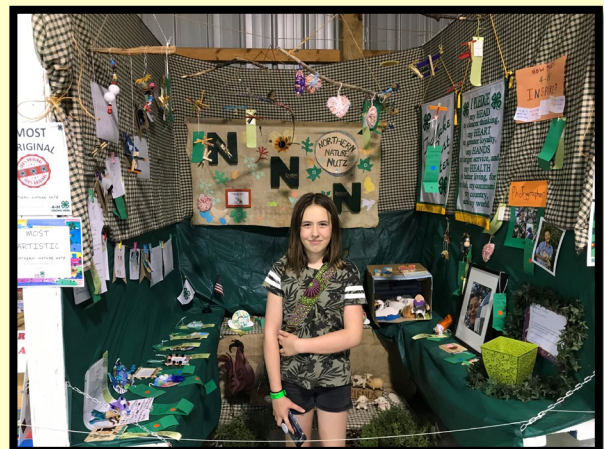
Isabelle 2019 club display at the NW MI Fair