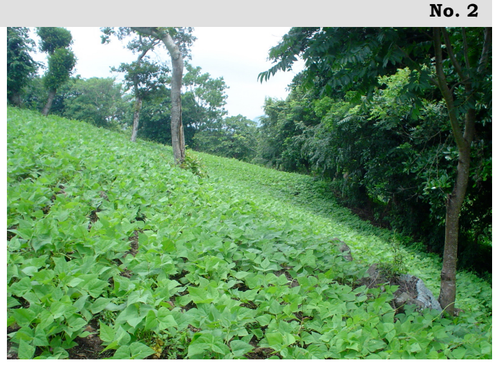
The bean crop against a Nicaraguan landscape

Recognizing the potential for spillover benefits, CIAT, with support from the Swiss Agency for Development and Cooperation (COSUDE), established Profrijol , a regional bean research network, in 1981. During the 1980s and 1990s, Profrijol was the only research network conducting bean research in the region. Initially, Guatemala was one of the main regional suppliers of germplasm for the network; however, in 1996 the PanAmerican Agricultural School (Zamorano, a private university located in Honduras), using funds from the B/C CRSP and Profrijol, was given a mandate to lead efforts to breed small red beans for the region. In 1999,