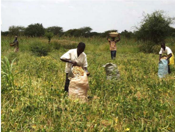
Figure 6 Farmers harvesting mature cowpea pods