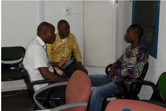
Figure 4 Enumerator conducting mock interview using ODK with tablet