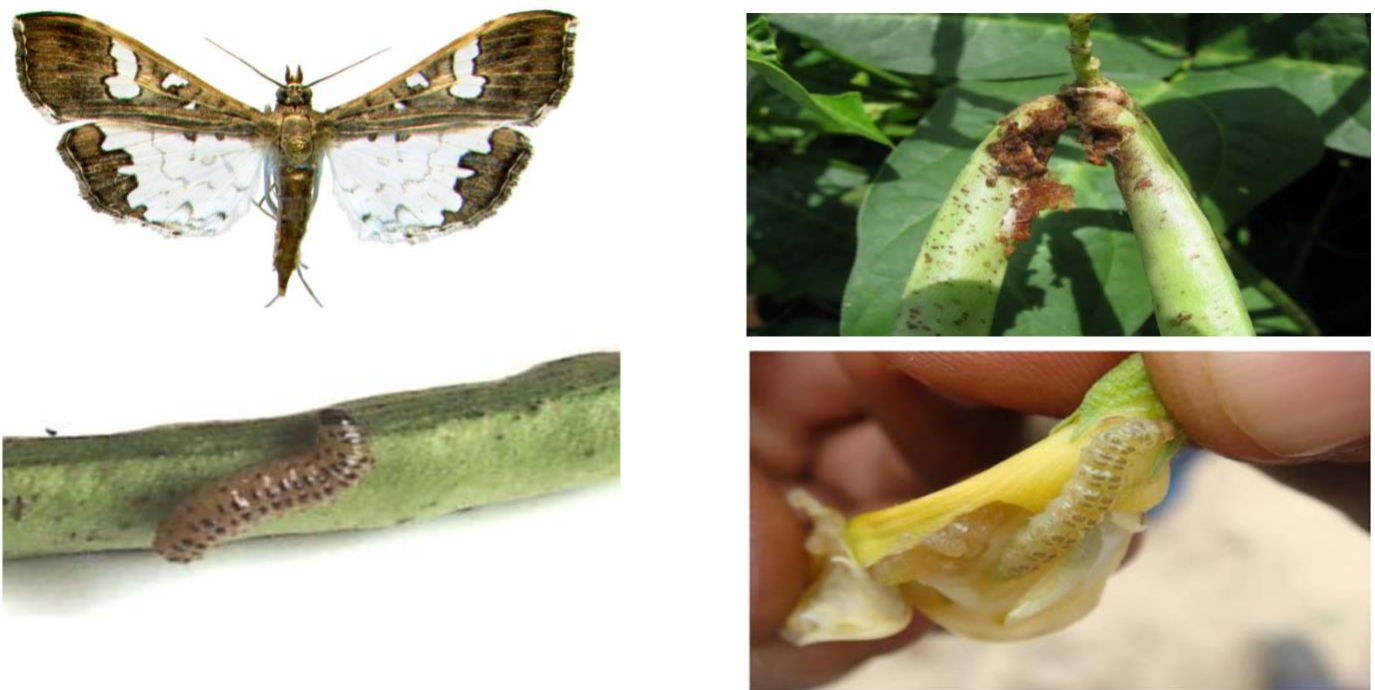
Figure 2 Maruca vitrata adult moth, larva, and damage on cowpea flower and pods

Activities under the three pillars focus on control of the cowpea pod-borer, Maruca vitrata , in Benin. This pod-borer is a major insect pest that reduces cowpea productivity in West Africa. Benin is an ideal location for developing this IPM approach because it is representative of the major cowpea agro-ecologies and smallholder demographics of West Africa. Also, the Biocontrol Unit of the International Institute of Tropical Agriculture (IITA) is located in Benin thereby increasing the cost-effectiveness of the project.