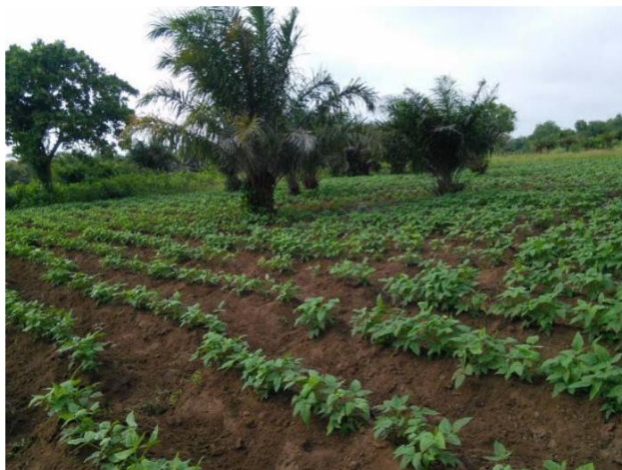
Figure 1 Cowpea field in southern Benin

collaboration with the Institut de Recherche Agricola du Benin (INRAB) have developed this innovative program. Based on crop and pest modeling, an expert system will be set up to provide the scientific basis for deriving and then identifying pest control solutions in real time. Solutions will involve new biological controls being tested here, along with biopesticides and other pest management options. Cellphone technology and simple visuals within an application will provide the data gathering and learning tools for farmers. Using surveys and choice experiments, the project team will assess the potential impacts of the use of such an integrated