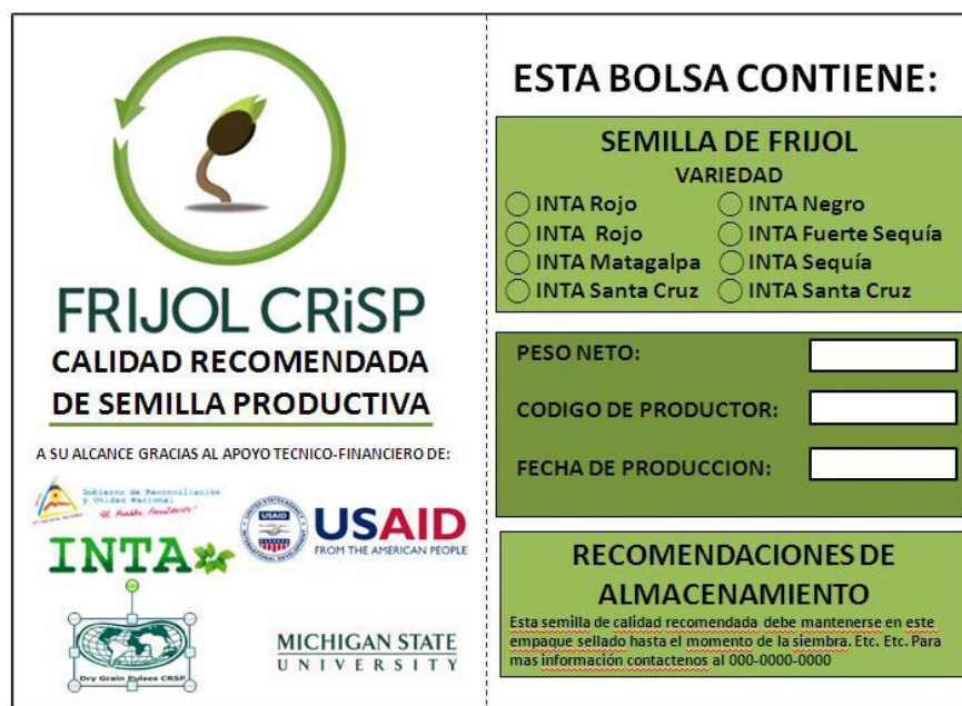
Figure 6. Mock-up version of label for a 20-lb package of quality declared seed.

laboratory equipment needed. The laboratory has been largely affected by the earthquake, but both Drs. Estevez and Beaver believe that with the provision of supplies and the missing equipment Dr. the laboratory can run again and reproduce the Rhizobium strains the project needs. Figure 7 shows Dr. Estevez visiting with Drs. Felix at Wesner at the recent visit to Haiti.