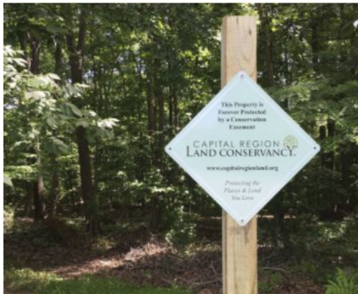
PeggyLester76 [CC BY-SA]