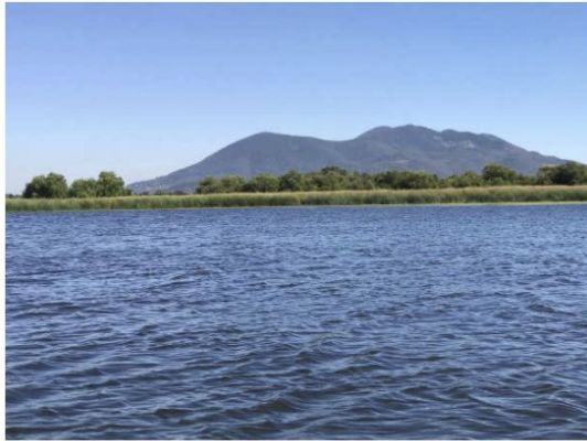
The shoreline of the 200-acre Wright property near Lakeport, California, which the Lake County Land Trust is purchasing with a grant from the Wildlife Conservation Board.