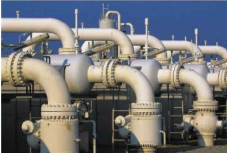
The Trump administration’s proposed new environmental regulations would largely ignore the impact of climate change in considering many new projects, including private pipelines. (Los Angeles Times)

By THE TIMES EDITORIAL BOARD JAN. 10, 2020 | 3 AM