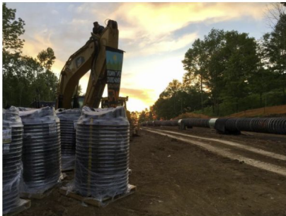
A Mountain Valley Pipeline protestor on an excavator in Summers County, West Virginia on Wednesday, June 26, 2019.