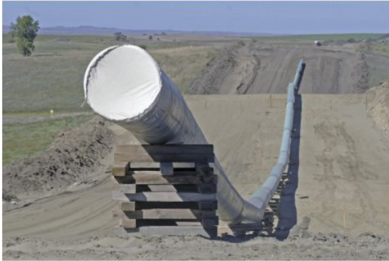
A section of the Dakota Access Pipeline under construction near the town of St. Anthony in Morton County, North Dakota, in 2016