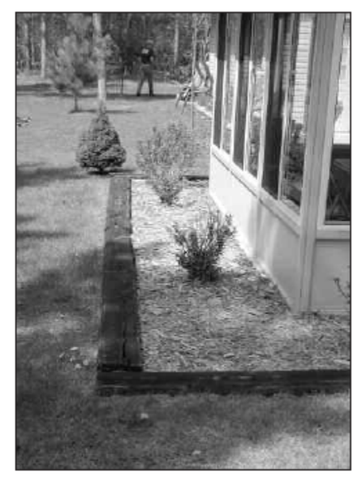
Figure 2The wood mulch in this photo is flammable and should be replaced with a non-comustible mulch such as limestone, rock or even mineral salt.

So, how should you manage this zone immediately adjacent to your home?