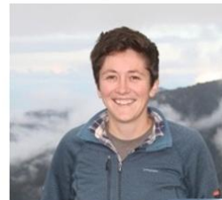
Fitzpatrick Lab at KBS