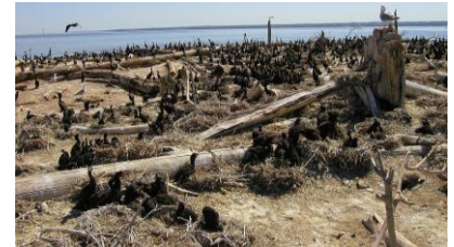
Caption: Image of double-crested cormorant colony.

Goal: Develop a hierarchical structured decision-making framework to guide when, where, and how much cormorant management is needed to balance fishery objectives with sustaining cormorant populations