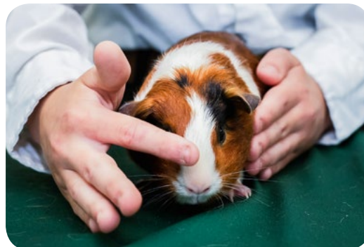
Posing the Cavy: Step 4

Set the front legs directly under the shoulders, and the hind legs under the hips, with the feet tucked under. Do this using one hand to set each foot separately. Make sure the cavy is not too stretched out or tucked in.