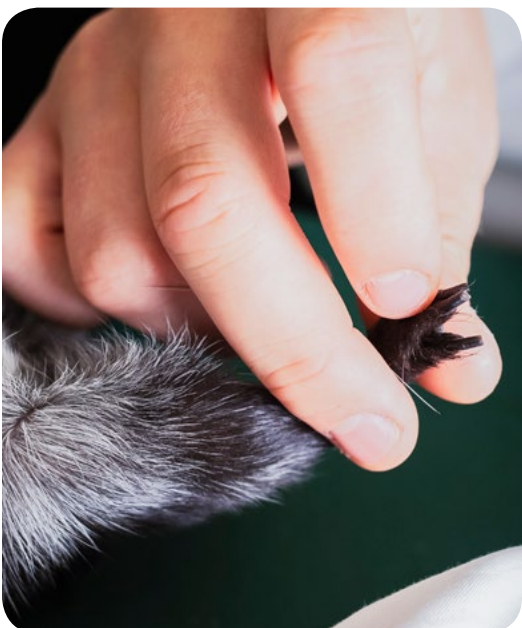
Examining the Cavy: Step 15.

Return the cavy to the upright position on the table. Check coat length according to breed standard.