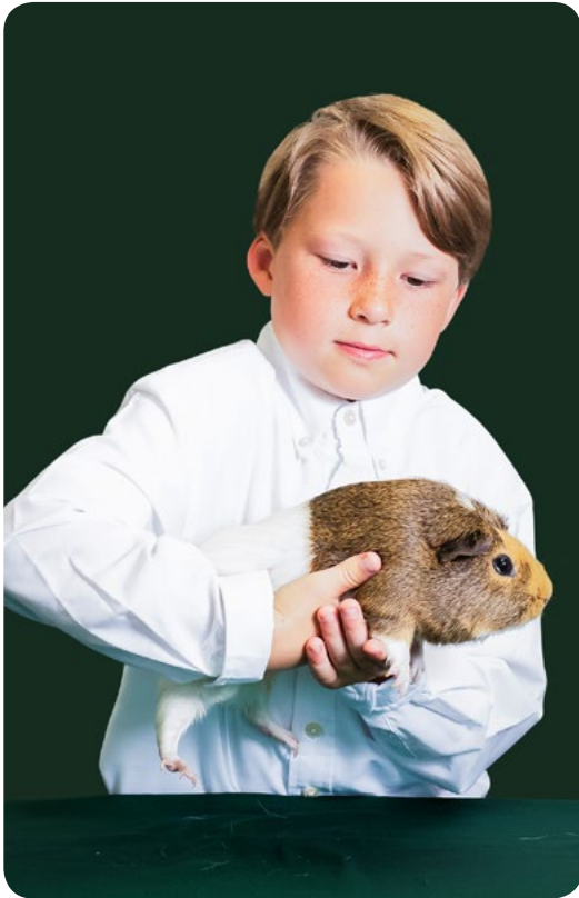
Handling the Cavy: Step 1

To properly hold your cavy, its head should be facing your elbow, resting on your forearm. Wait for the judge to ask you to handle your cavy.