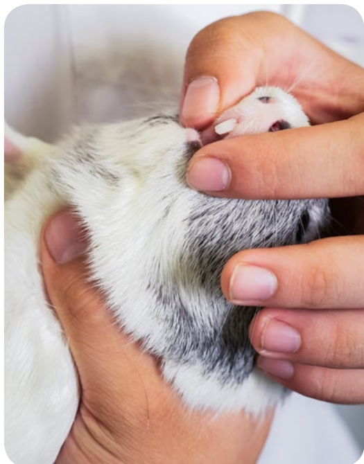
Examining the Cavy: Step 8