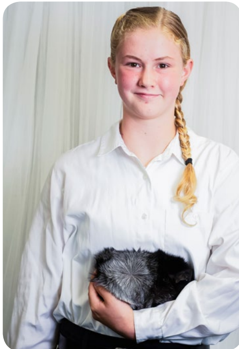
Handling the Cavy: Step 4