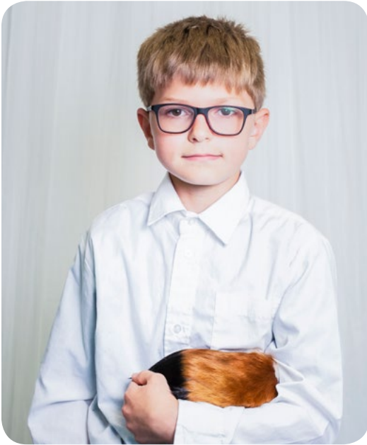
Posing the Cavy: Step 1

S howmanship is a nonverbal event, except when asked a question.