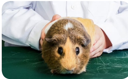
Posing the Cavy: Step 3