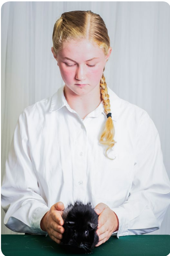
Examining the Cavy: Step 20.

At this point, the examination is complete. Carry out the sequence of the examination systematically, confidently and smoothly. Take your time and make sure the judge sees you work through these steps.