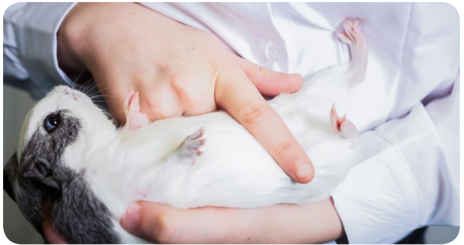
Examining the Cavy: Step 13.