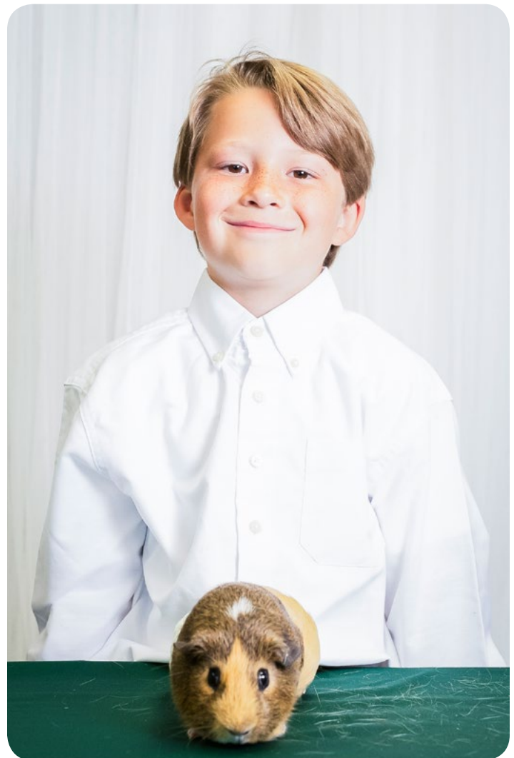
Examining the Cavy: Step 21.