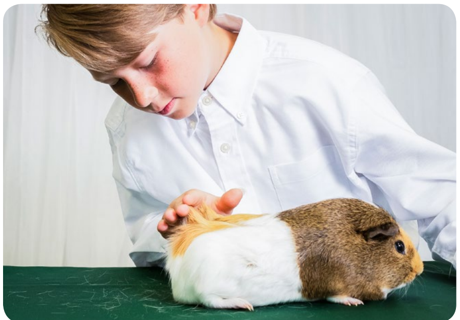
Examining the Cavy: Step 18.