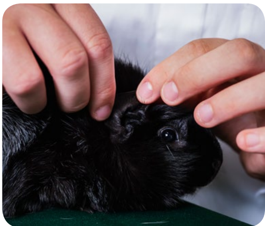
Examining the Cavy: Step 3