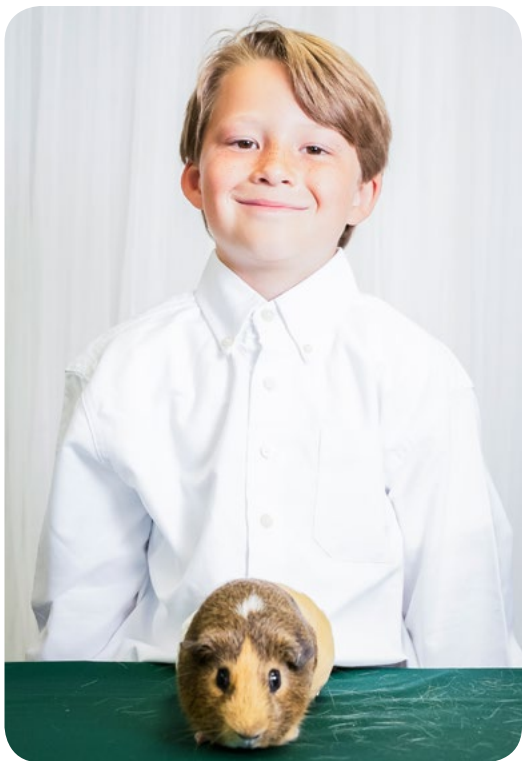
Handling the Cavy: Step 9