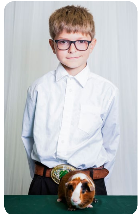
Handling the Cavy: Step 5