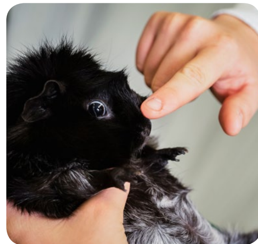
Examining the Cavy: Step 7