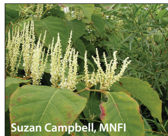
Suzan Campbell, MNFI

Knotweed has numerous, small, creamy white flowers. They are arranged in spikes near the end of the plant's arching stems. In Michigan, they bloom in August and September. Knotweeds are insect-pollinated.