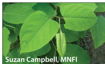
Suzan Campbell, MNFI

Its leaves are simple, alternate and broad, typically growing up to 15 cm (6 in) long and 12 cm (5 in) wide. They have an abruptly pointed tip and a flat or tapering base.