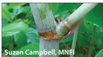
Suzan Campbell, MNFI

Japanese knotweed stems are upright, round, hollow, and often mottled, with a fine whitish coating that rubs off easily.