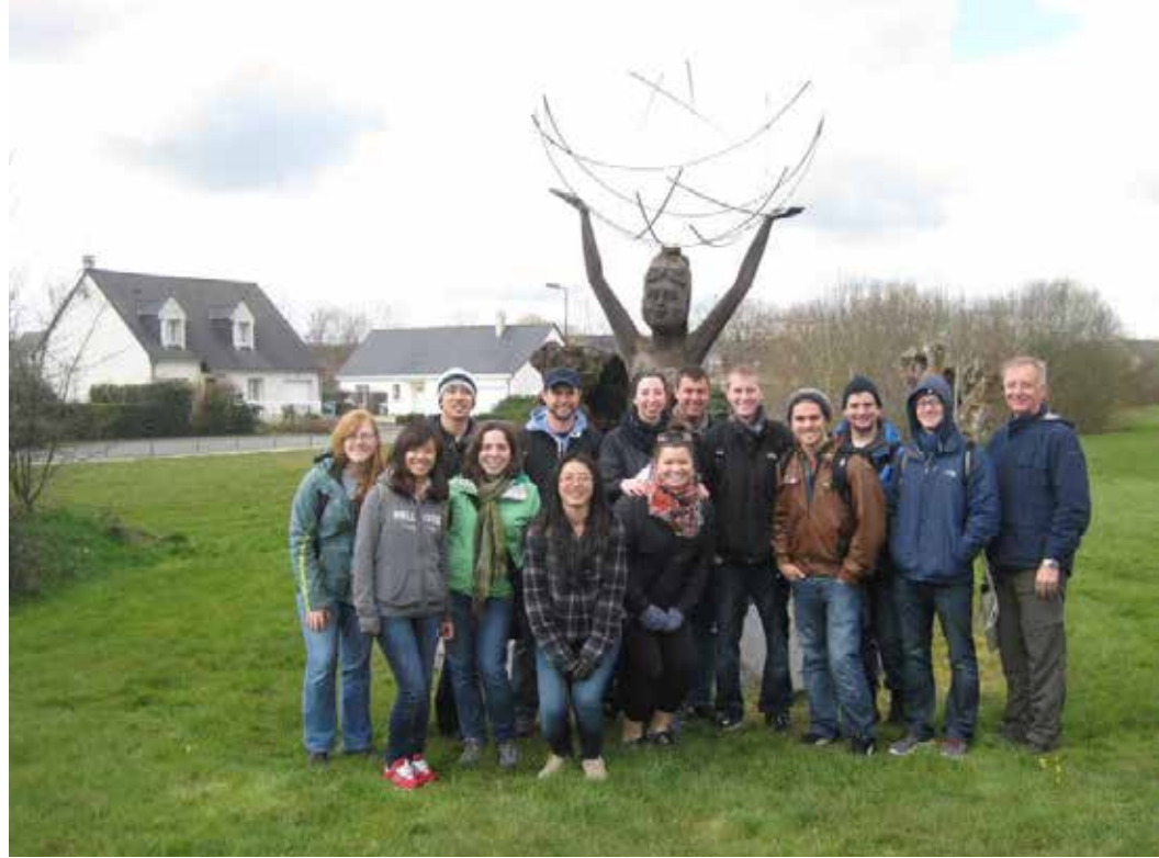
The 2013 Overseas Study gang.