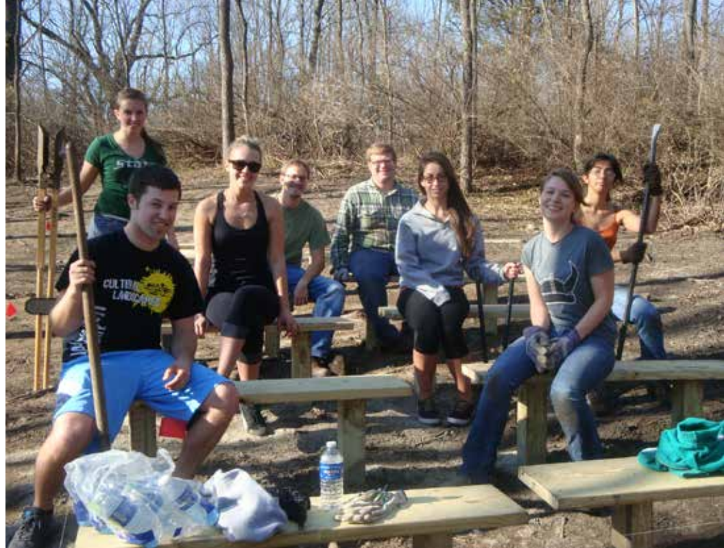
Students take a break while volunteering at Woldumar Nature Center.

* ( http://www.golfdigest.com/magazine/2008-05/environment_intro#ixzz2PYg1PaiB )