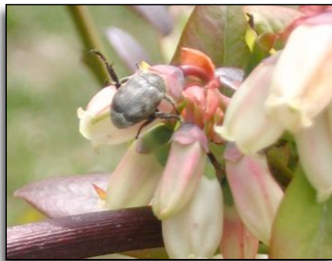
Hoplia flower beetle on blueberry flowers in 2007, viewed from the rear.

As a rough threshold, if more than 2% of flower buds are eaten completely off, you should consider control. This is based on 2% of a typical yield being worth more than the cost of an application. In fields of concern, sample a representative 10 bushes spread throughout the field and sample ten flower buds on each bush to give 100 buds sampled. If more than 2 of these buds are eaten, consider an application of one of the insecticides that work well against Japanese beetle. Be aware that there are no insecticides registered for use in blueberry with this beetle on the label. Also be aware that we are approaching bloom and any application of insecticide with long residual activity runs the risk of causing harm to bees. A week from bloom, avoid broad spectrum insecticides. Spray insecticides only if this pest is causing economic levels of damage