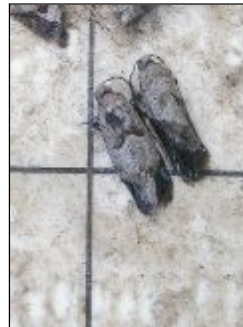
Cherry fruit worm (left) and the contaminant found in cherry fruitworm traps, Pseudexentra vaccinii (right).