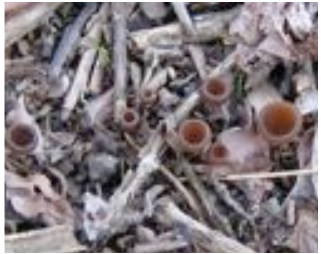
Figure 1. Mature "mushrooms" or "trumpets" (apothecia) were observed at Grand Junction on 4-25-08.

To scout for mummy berries (pseudosclerotia) and mushrooms (apothecia) in fields with susceptible varieties, visually examine an approximately 9 sq ft area of soil at the base of each of five bushes spread out in a row, preferably a mummy berry "hot spot" near a treeline or woods. Count the number of mummified berries and mushrooms (Figure 1).