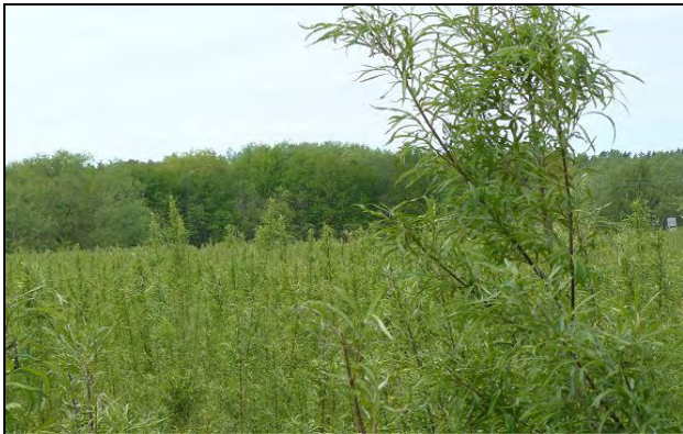
Willow energy plantation.

Extensive knowledge about forest soils and nutrient cycles will help support the sustainable use of wood in a bioeconomy. Michigan, Minnesota, and Wisconsin have each published biomass harvesting guidelines applicable to forest resources. A recent study on the Superior National Forest suggests that northern forests should be able to sustain increased biomass removal, but the economics of harvest may be an issue.