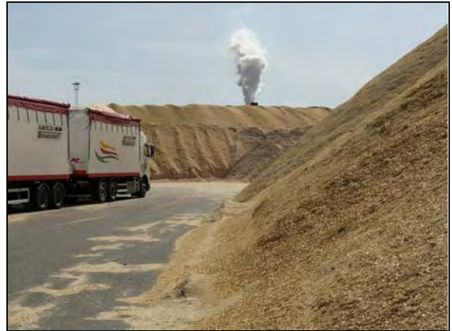
Wood feedstock for a large pellet plant.

assistance were made available. Hybrid poplar and willow show the most promise. Though plantations require energy inputs, research and practice in Swedish willow plantations show that outputs exceed inputs, and willow provides a significant portion of Sweden's domestic energy raw material.