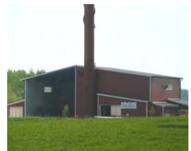
Small district energy plant.

Wood holds great promise as a renewable and sustainable energy source. Michigan could use more renewables—wood, wind, solar, agricultural residues, manure, and municipal solid waste--to meet energy demands. Conservation and efficiency practices could also contribute to a much reduced reliance on coal, oil, and natural gas. Most likely, society and the marketplace will determine how far and how fast we engage an expanded bioeconomy.