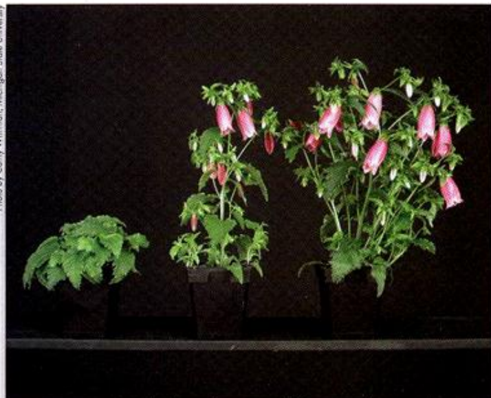
The long-day perennial Campanula punctata 'Cherry Bells' was grown under nine-hour short days (left) or 16-hour long days provided with either incandescent (center) or high-pressure sodium lamps (right).

petunia is not responsive to long-day lighting until two to three weeks after sowing. Cuttings and liners generally do not have a juvenile