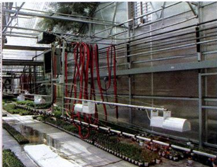
High-pressure sodium lamps are mounted on a boom for photoperiod control of perennials.