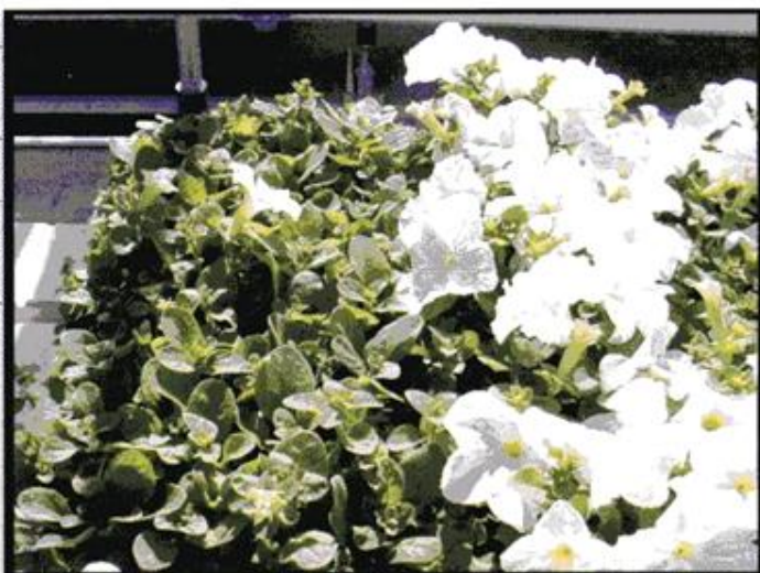
No HPS before transplant HPS before transplant