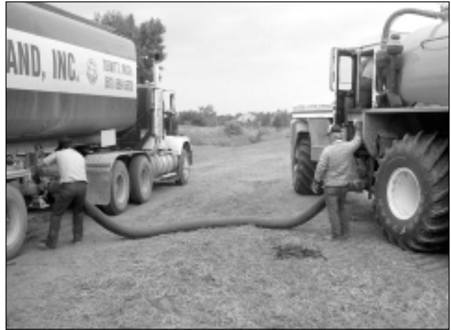
Liquid biosolids are transported to agricultural fields by large tankers and then transferred to applicators for injection into the soil (Benton Harbor-St. Joseph land application program).

One type of biosolids that is becoming more common recently is dried and/or pelletized biosolids. Because producing biosolids in this form is complex and expensive, dried biosolids are often blended with other materials and marketed as an organic-based fertilizer with balanced nutrient levels. Alkaline stabilization has been used to produce a nearly