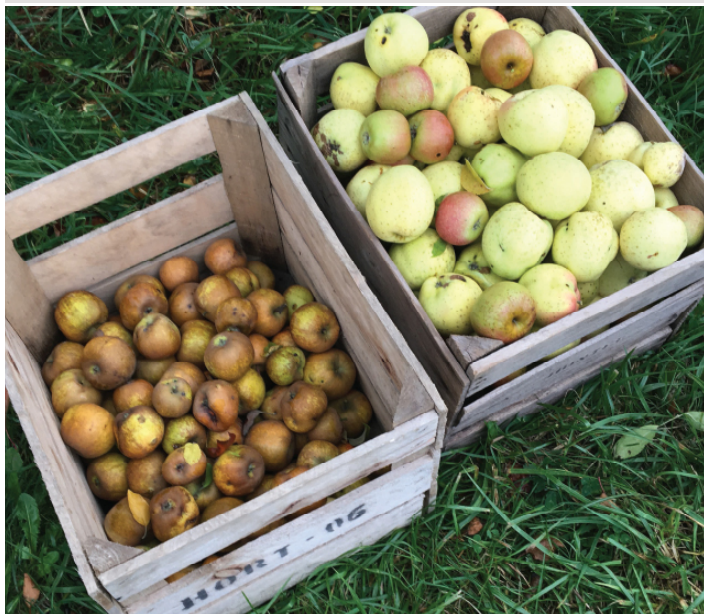
Figure 2. Cider apples harvested from the MSU Horticulture Teaching and Research Center (left, 'Golden Russet'; right, 'Yellow Bellflower').

data on production, disease and pest resistance, storage capacity, and compositional juice quality.