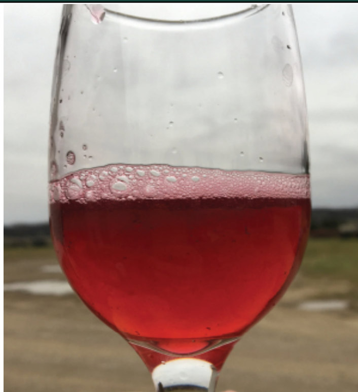
Figure 7. Freshly pressed juice from the cultivars 'Otterson' and 'Mutsu' in a 1:1 ratio.