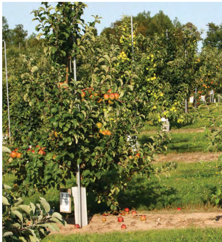
Figure 4. The USDA-NPGS-NGRP apple germplasm collection located in Geneva, NY in August.

Another excellent resource for Michigan growers is the publication, 'Hard Cider Varieties Suitable for Northern Michigan'. This describes a six-year study by MSU evaluating 35 traditional cider cultivars for production traits such as yield, vigor and harvest