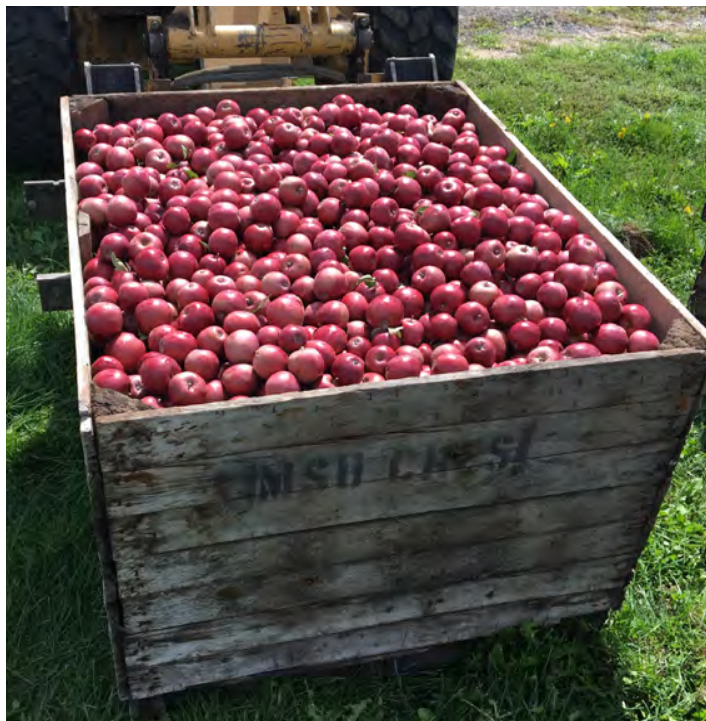
Figure 3. A bin of the red-juiced cultivar ‘Otterson’, which has been used in a few commercial hard ciders.

systems was developed by the Long Aston Research Station in the United Kingdom (U.K.) 5 . The U.K. system lists four categories: Sweets, Sharps, Bittersweets, and Bittersharps (Table 1). British cider makers typically blend juice from multiple classes to produce a balanced, consistent product.