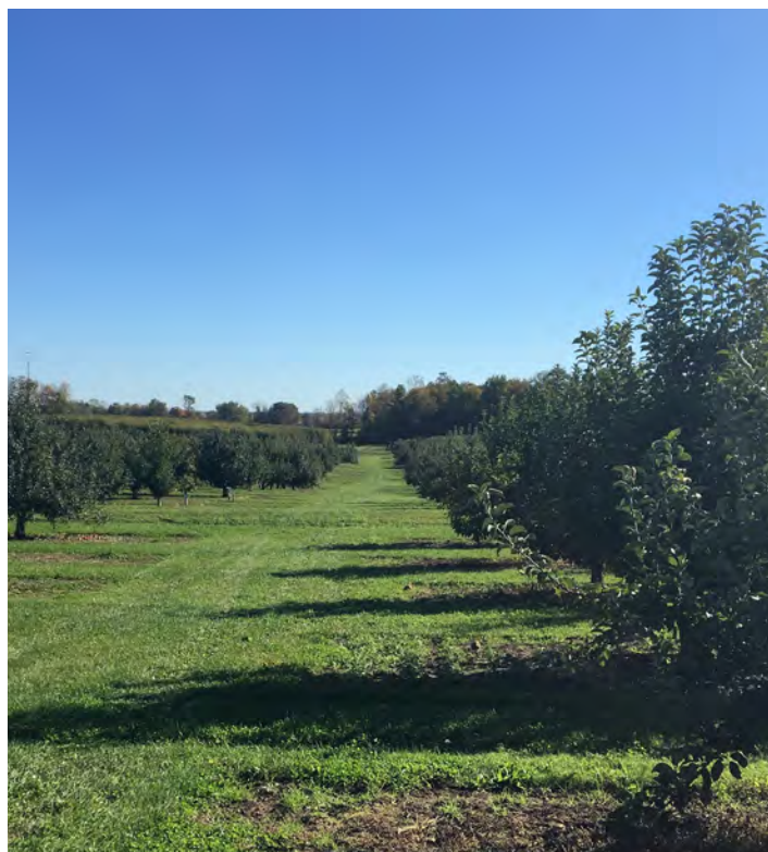
Figure 5. The USDA-NPGS-NGRP apple germplasm collection located in Geneva, NY in October.