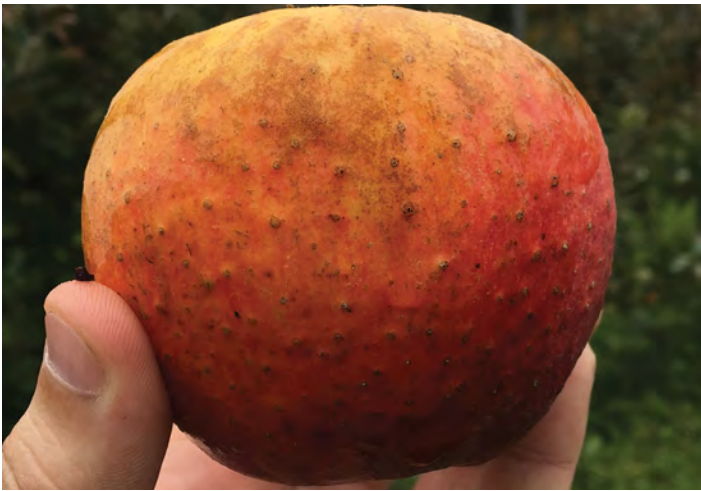
Figure 6. A new variety that has a potential use for cider production being tested at MSU Clarksville Research Center.

season as well as fruit firmness, sugar content, flavor, and starch. Trees were grown at the MSU Northwest Research Station near Traverse City, MI on vigorous rootstocks and were subjected to evaluation after four to ten years of growth. Although the study was limited by the biennial bearing nature of most of the cultivars, this trial yielded numerous data that are important to prospective growers. For example, several cultivars failed to yield a significant crop, even after ten years! Many others produced fruit that was inherently poor quality and/or very susceptible to disease. A summary of the results of this study, including lists of cultivars that were found suitable or not suitable for Northern Michigan, are shown in Appendix 2 and 3.