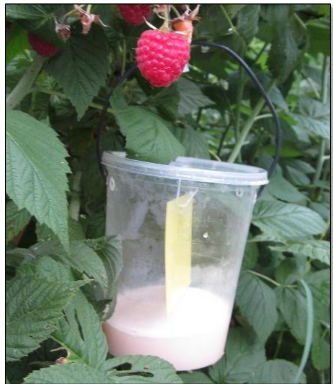
Fig. 2 A yeast-sugar baited monitoring trap with a yellow sticky trap hung within a raspberry canopy.

Traps must be baited to attract SWD. An effective homemade bait can be made by combining 1 tablespoon active dry yeast, 4 tablespoons sugar, and 1.5 cups of water. The bait should be added to the trap with a 1" depth. Alternatively, you can use a commercially available lure. The Scentry lure (Scentry Biologicals, Inc.) is a gel sachet that