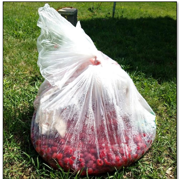
Fig. 4 Waste fruit disposed of in a clear trash bag.

Over-ripe and damaged fruit can act as a reservoir for SWD and other pests, increasing their populations and making them even harder to control. Some U-pick operations have customers collect damaged fruit as they pick,