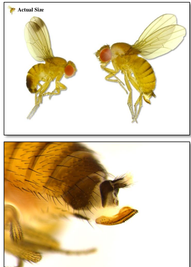
Fig 1. Spotted wing Drosophila (SWD), male (top left), female (top right), and the female's serrated ovipositor (bottom). Actual size of the fly is shown in the top left corner.

In Michigan's southern peninsula, first SWD fly activity is typically in mid-June to early July and the population builds through the summer as temperatures continue to rise. Highest densities of SWD occur in August and September, so SWD is especially problematic for later-season berry crops, including blackberries, fall raspberries, ever-bearing strawberries, and late-season blueberries. Adults live for two to three weeks and females can lay more than 300 eggs, so they