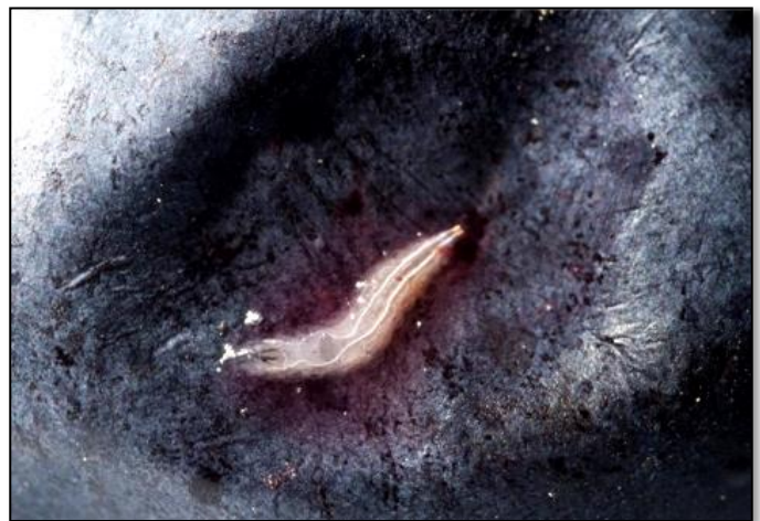
Fig. 3 A large late-instar SWD larvae on the surface of a blueberry.