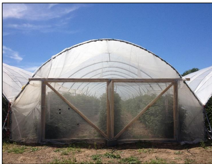
Fig. 6 Exclusion netting fitted to a high tunnel raspberry system, with doors to allow for sprayer access.

Holes from equipment, storms, etc. will need to be patched – taping both sides or using thick