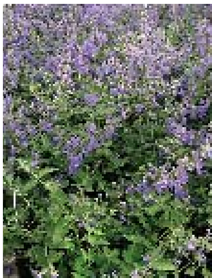
Figure 1. Nepeta 'Walker's Low' creates a beautiful backdrop of silvery-green foliage and dainty lavender-blue flowers.

Nepeta 'Walker's Low' does not produce viable seeds and is commercially propagated by shoot-tip cuttings or divisions. In our studies, shoot-tip cuttings dipped in rooting hormone rooted in five to seven days under mist in a propagation facility set at 72°F.