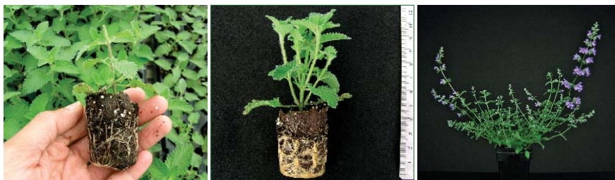
Figure 2. Seventy-two-cell plugs of nepeta 'Walker's Low' received from a commercial grower were grown in plug trays for 20 days in a 68°F greenhouse under a 16-hour photoperiod. Plugs were pinched (left) and further grown for 10 days to promote lateral branching (center) and then transplanted into 5.5-inch containers and grown under the same environment. Plants flowered in three to four weeks and adequately filled the containers at flowering (right). No plant growth retardants were applied to the finished plant.

ies, no plants flowered under a short-day photoperiod of nine hours. In the same trial, all plants flowered under a long-day photoperiod of 16 hours provided as a day-extension. Because 'Walker's Low' is a full-sun plant, supplemental light is beneficial during forcing. In our study, when a 16-hour photoperiod was provided using incandescent lamps (low light treatment),