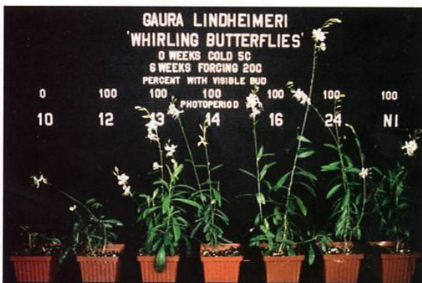
Figure 2. Gaura 'Whirling Butterflies' is an example of a no-cold-requiring, long-day plant (category 3). Plants flower without cooling under photoperiods greater than 10 hours. Therefore, photoperiods of 9 to 10 hours are recommended to maintain vegetative growth for stock plants. NI = 4-hour night interruption.