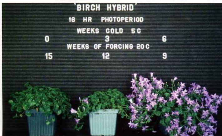
Figure 5. Campanula 'Birch Hybrid' requires at least 6 weeks at 5 °C (41 °F) for rapid flowering. Shorter durations result in poor and delayed flowering, or no flowering at all.

At this stage of the production cycle, plants are in the final container and the flowering process is promoted by a previous vernalisation treatment, by forcing photoperiod, or both. If plugs have been kept vegetative throughout propagation, bulking, and vernalisation, time to flower should be predictable and uniform throughout the crop. For the highest quality finished plants, moder-