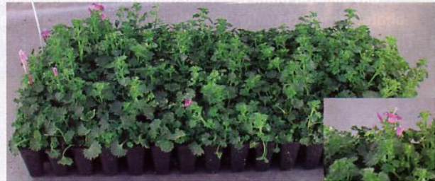
Figure 4. Example of plugs arriving in flower when the plants were intended for planting and bulking.

Maintaining vegetative growth in plants that do not have a cold requirement or a photoperiodic response (category) can be a challenge. Some