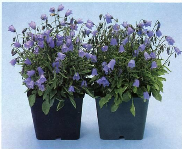
The larger the plant at bulking, generally the larger it will be at flowering.

The quick-crop perennial production system for vegetatively-propagated perennials has five main phases: stock plant production and management; propagation; bulking (i.e., allowing plants to increase in mass); vernalisation; and forcing to flower. At each stage of production, the environmental conditions are optimised to ultimately produce a quality, uniform flowering crop. Quick-crop production can also apply to seed-propagated perennials, but our research has focused on vegetatively-propagated perennials.