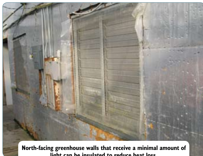
North-facing greenhouse walls that receive a minimal amount of light can be insulated to reduce heat loss.