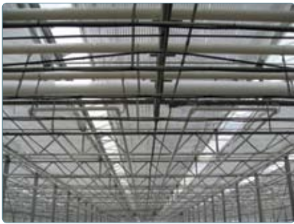
Installing energy curtains can improve greenhouse energy efficiency and lower the overall carbon footprint of each plant.

means, and with the least possible hazard to people, property and the environment.