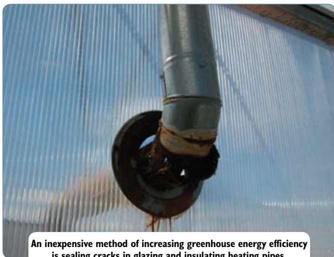
An inexpensive method of increasing greenhouse energy efficiency is sealing cracks in glazing and insulating heating pipes.

To manage water sustainably, monitor and record the amount of water used onsite. This can be done