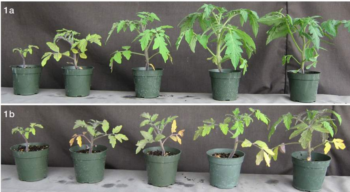
Photos 1a and 1b. Tomato transplants grown in dairy solids vermicompost (A) and sawdust-based vermicompost (B) added to a peat/perlite substrate at rates of (L to R) 0%, 5%, 10%, 20% and 30% by volume.

In summary, if you're intending to add vermicompost to your container substrates, we recommend testing early and often. Work with your vermicompost supplier to understand their material and recommendations for using it in container production, then be sure to monitor the pH and EC of your substrate before planting and during production. We recommend that growers make small batches of vermicompost containing substrates and that they test them under their own growing conditions. GT